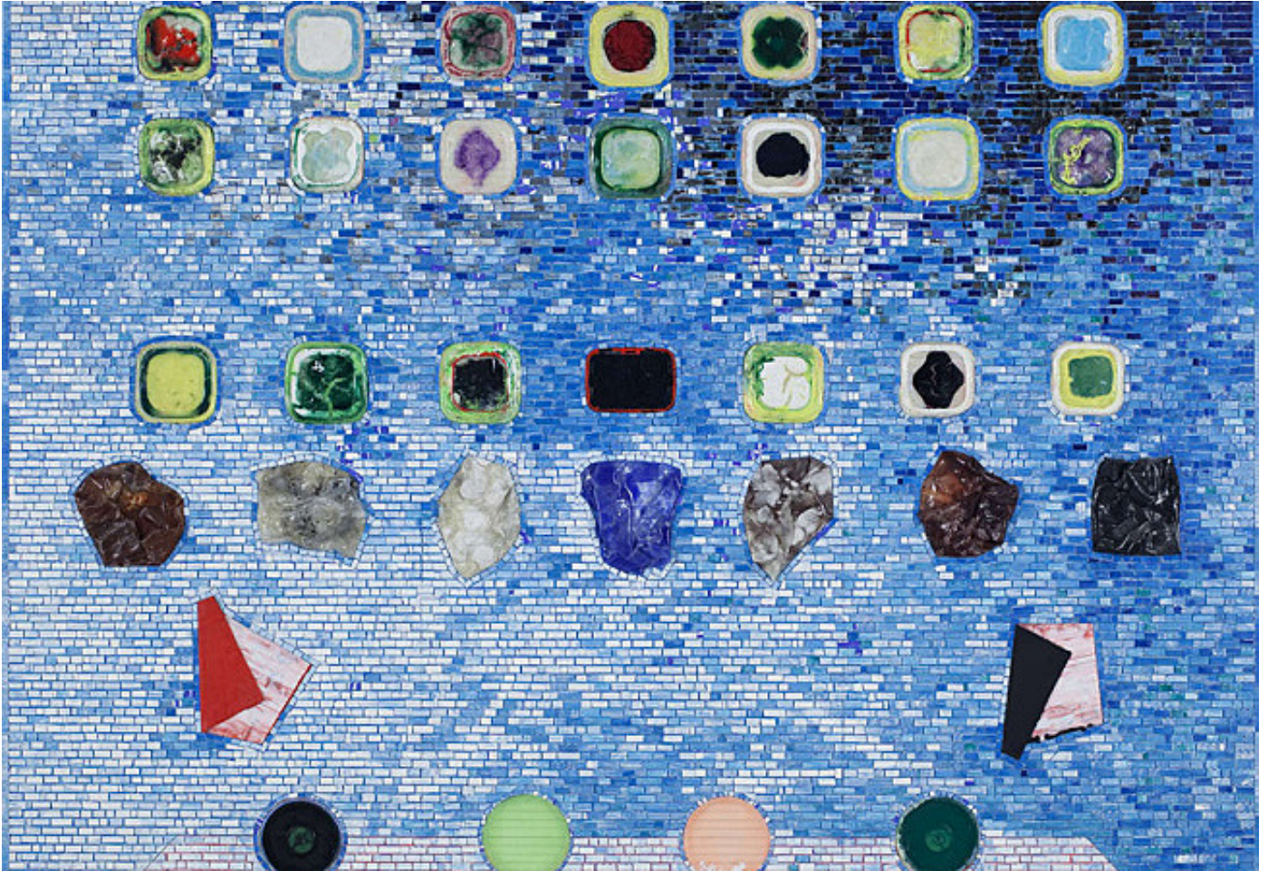
Jack Whitten, Apps for Obama , 2011, acrylic on hollow core door, 84 x 91 in.