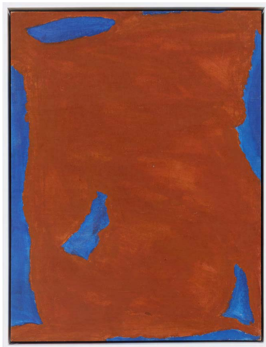
Brick in the Sky , 1968, acrylic on linen, 39.50h x 30w in (100.33h x 76.20w cm)