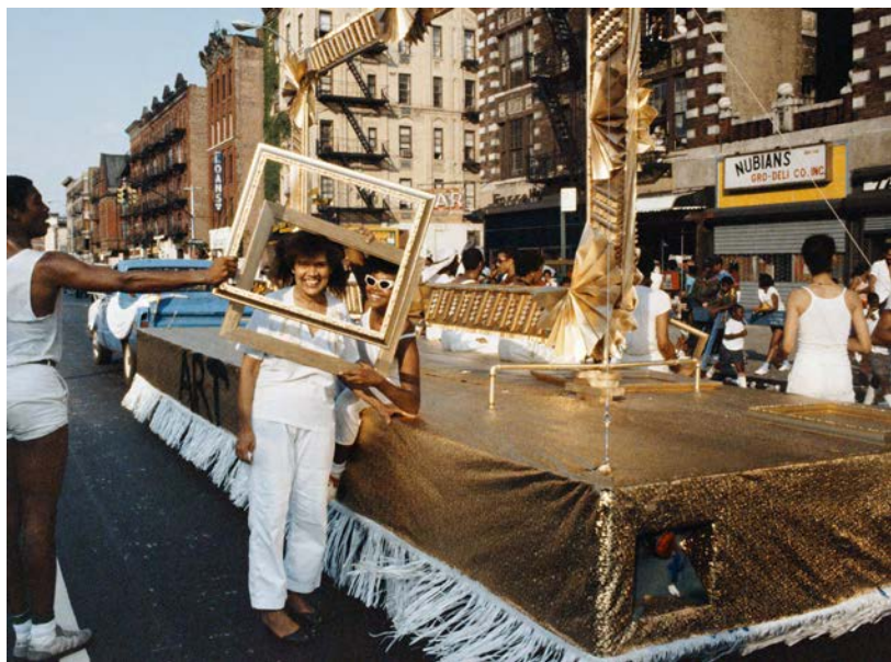
Art Is . . . (Nubians), 1983/2009, c-print, 16h x 20w in (40.64h x 50.8w cm), edition of 8 + 1 AP (Ed. 1/8)