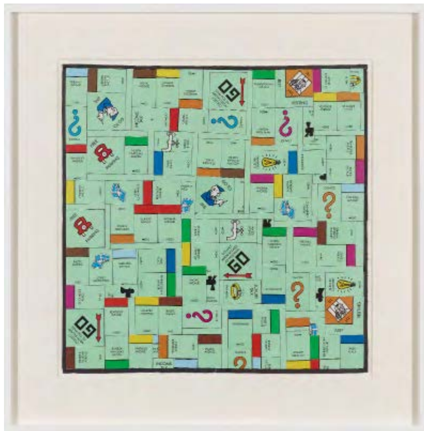
Monopoly, 2012–2017, Monopoly game board, 20.25h x 20w in (51.44h x 50.80w cm)