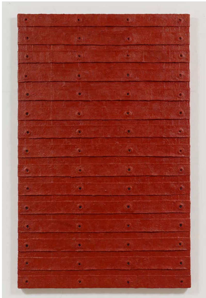
Red Stack , 2015, oil and mixed media on canvas, 80.25h x 50.50w x 2.50d in (203.84h x 128.27w x 6.35d cm)