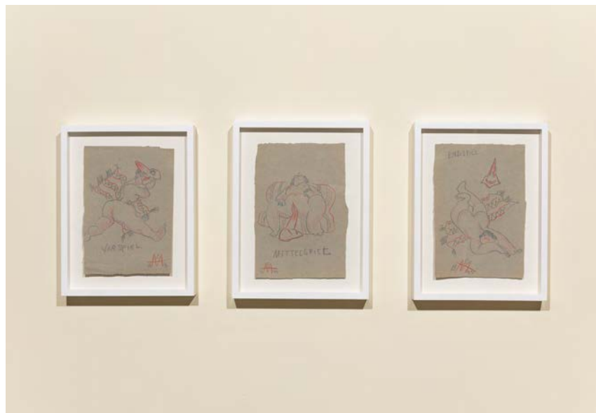
Untitled, 1943, colored pencil on paper, dimensions variable