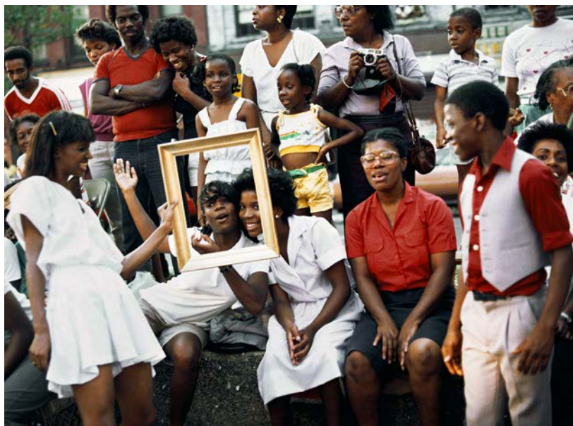
Art Is... (Women in Crowd Framed), 1983/2009, c-print, 16h x 20w in (40.64h x 50.8w cm), edition of 8 + 1 AP (Ed. 3/8)