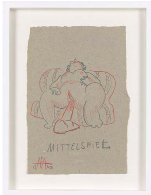
Untitled, 1943, colored pencil on paper, 9.88h x 6.65w in (25.10h x 16.90w cm)