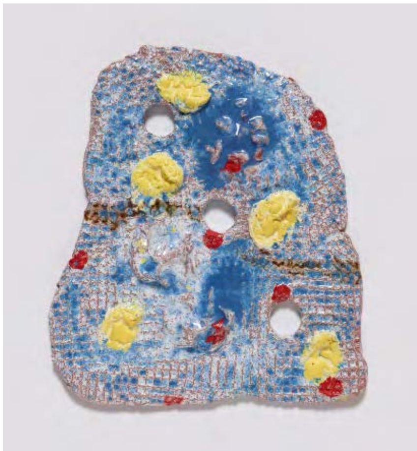
Georgie , 2015, ceramic and glaze, 14.50h x 12.63w in (36.83h x 32.07w cm)