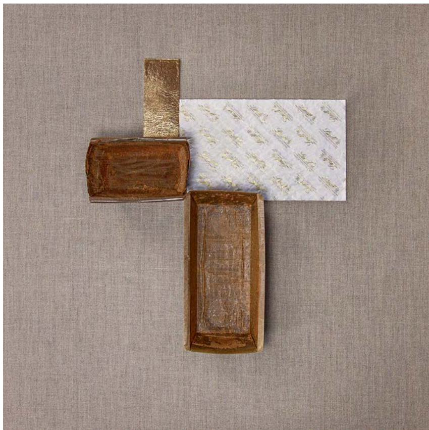
Sugar Blues (IX) , 2013, mixed media, 33.25h x 33.25w x 7d in (84.45h x 84.45w x 17.78d cm)