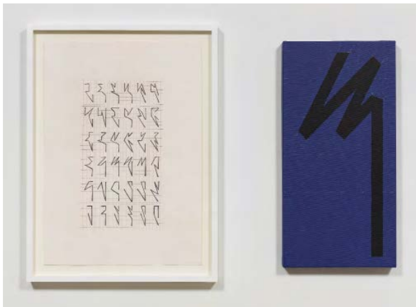
Seven Points Angular Lines - Part 1 , 2013, mixed media, 23.40h x 16.50w in (59.44h x 41.91w cm)