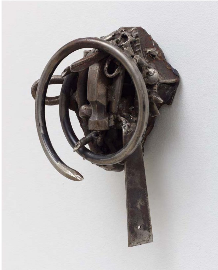
No Rem , 2012, welded steel, 12h x 8.50w x 7.50d in (30.48h x 21.59w x 19.05d cm)