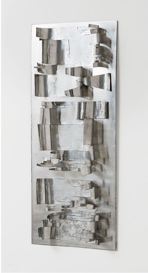
Untitled (c. 1970), Maria Bartuszová. Alison Jacques Gallery (price on application).

Alison Jacques Gallery is this year moving down to the ground floor, where more historical works are usually displayed. Its stand will include sculptures from the 1960s and '70s by the Slovak artist Maria Bartuszová (€50,000–€500,000), who will be the subject of a retrospective at Tate Modern next year. Another artist with a Tate show, the Guyana-born British painter Frank Bowling, is included in one of 24 projects in the fair's 'Feature' section of solo or curated presentations. Hales Gallery brings six of Bowling's previously unshown Cathedral Paintings from the 1980s, inspired by Evelyn Waugh's novel A Handful of Dust (1934) and built up with materials and objects through