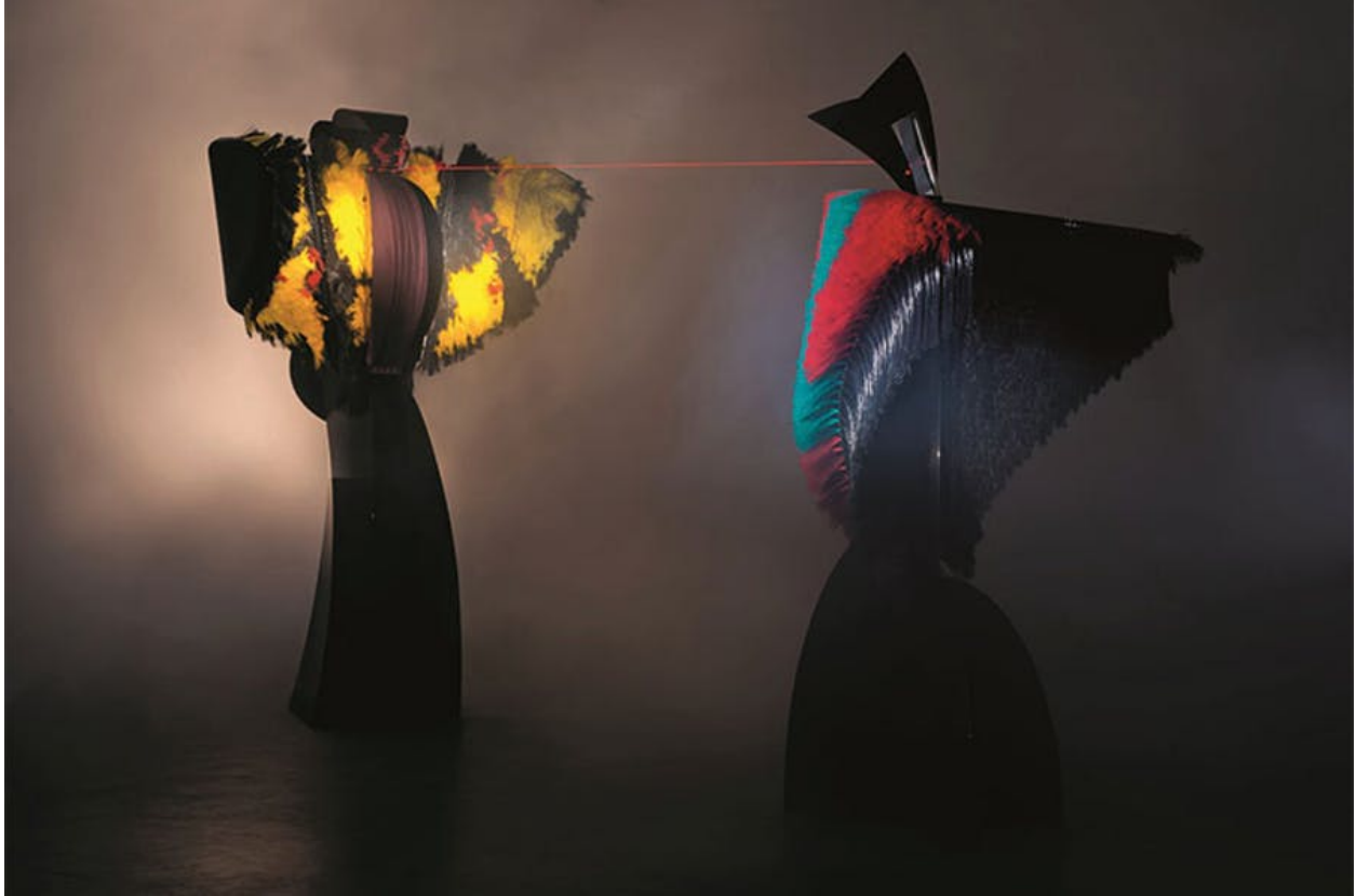
Conjunction of Opposites: Woman of War and Lady of the Wild Things (1983–86), Liliane Lijn. Rodeo (price on application). Courtesy the artist and Rodeo, London/Piraeus

Falling towards the end of the art market season, Art Basel, held in halls in the city's Messeplatz (13–16 June), serves as a summary of all that has built up before. This year marks the fair's 50th edition, and while celebrations are being saved for next year, efforts from the exhibiting modern and contemporary art galleries – around 290 in total – are appropriately impressive.