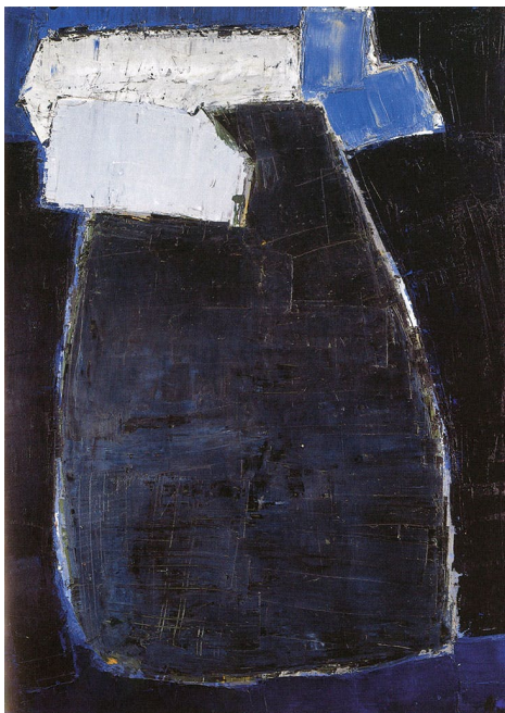
Grande Composition Bleue (1950–51), Nicolas de Staël. Applicat-Prazan (price on application)