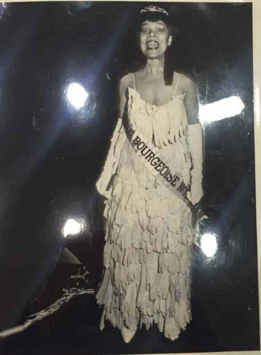
New Museum for Contemporary Art, NYC. "Mlle Bourgeoise Noire Goes to the New Museum." (2011) Guerrilla performance, [Sept. 18, 1981]

The Lorraine O'Grady Papers in the Wellesley College Archive comprise the personal and professional papers of the artist, a graduate of Wellesley College Class of 1955. The archive includes correspondence, photographs, books, journals, and audiovisual materials from 1952 to 2012 that richly record her artistic developments and achievements. In totality, the papers reveal the significance of visual art and writing to an astute practice of cultural criticism while pointing to a keen awareness of the importance of thoroughly documenting works of art, including the ephemeral actions and performances that define part of O'Grady's activity in the 1980s.