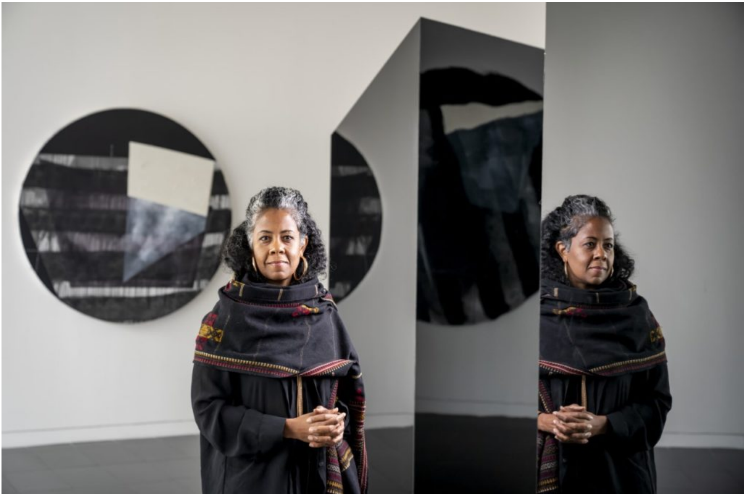
Torkwase Dyson with installation Nautical Dusk , 2018.

Brian Boucher ( https://news.artnet.com/about/brian-boucher-244 ), November 14, 2019