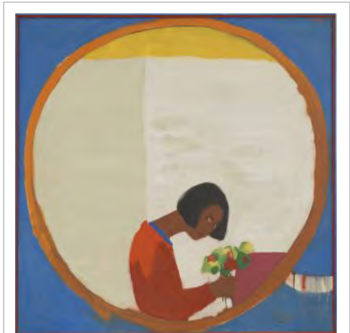
Emma Amos, Flower Sniffer, (1966) Collection of the Brooklyn Museum of Art

We are now able to go back in time and reconsider the work of leading artists from earlier generations, such as Emma Amos and Faith Ringgold, for whom narrative did not once have as meaningful a frame of reference.