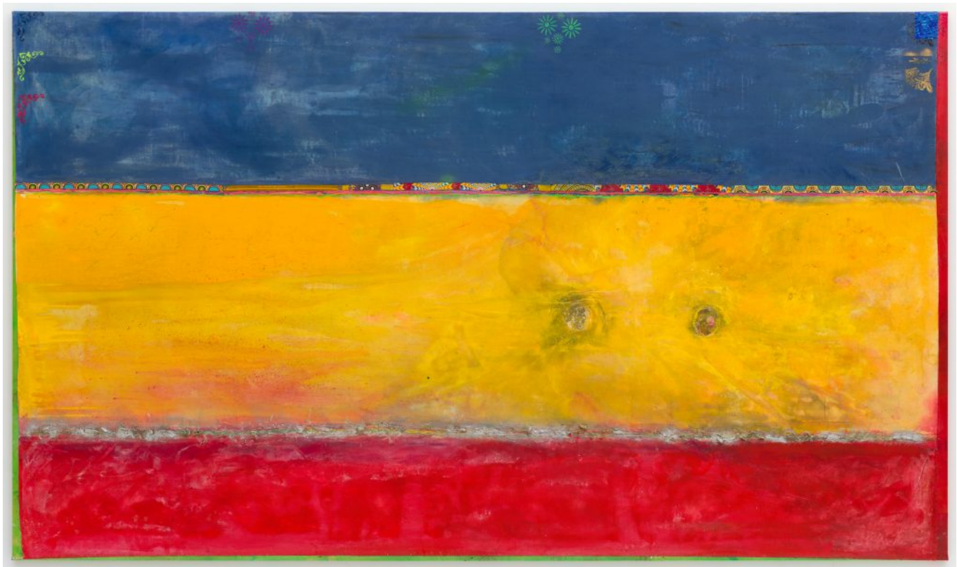
Frank Bowling, "Elder Sun Benjamin" (2018) Photo: Katherine Du Tiel, © Artists Rights Society, New York

Charles Desmarais | June 28, 2019 | Updated: June 29, 2019, 10:13 am