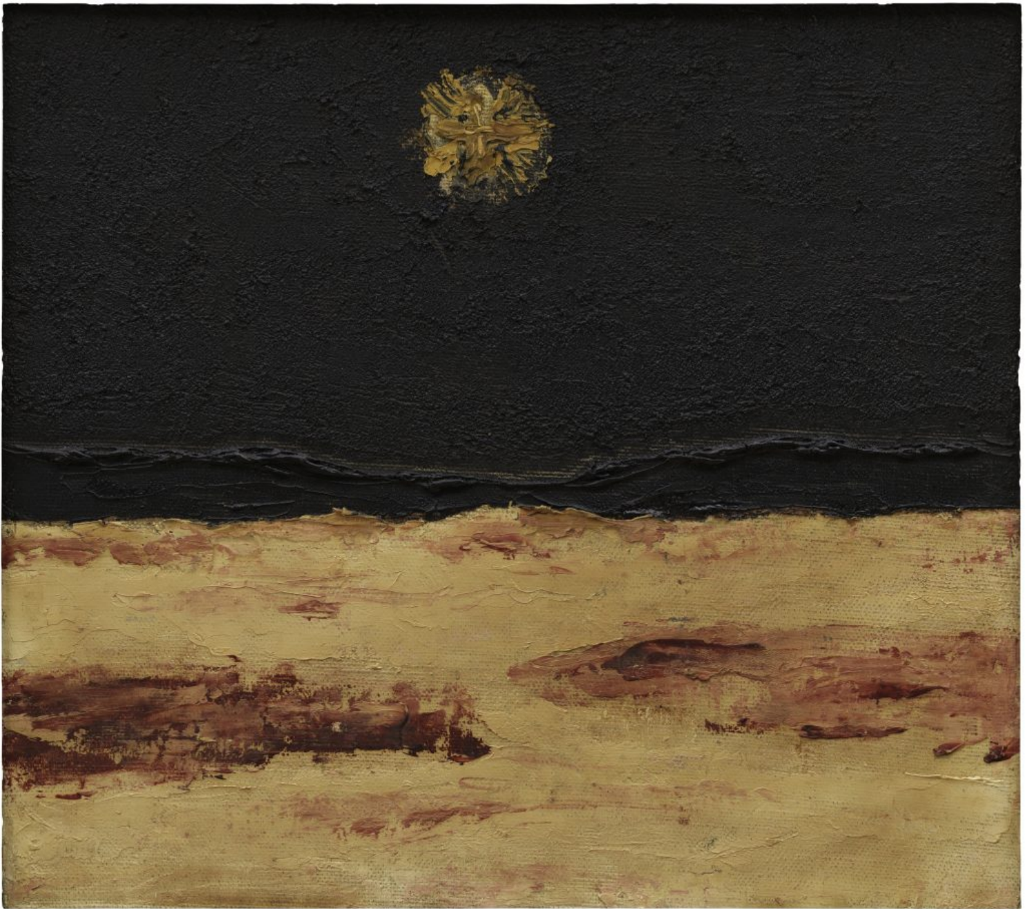
Forrest Bess, "Seascape With Star"

Forrest Bess was a visionary artist whose famously idiosyncratic sexual theories seem, somehow, to offer cues to his meditative landscapes. His tiny "Seascape With Star" was painted around 1949, Garrels surmised. A flesh-colored sea roils with blood-red waves, under a sky of solid black. An inscription on the back is likely a reference to the visions Bess claimed were the source of his imagery. "There was a variation," the artist wrote. "The star turned into a sun with many satellites. ... It will not be painted."