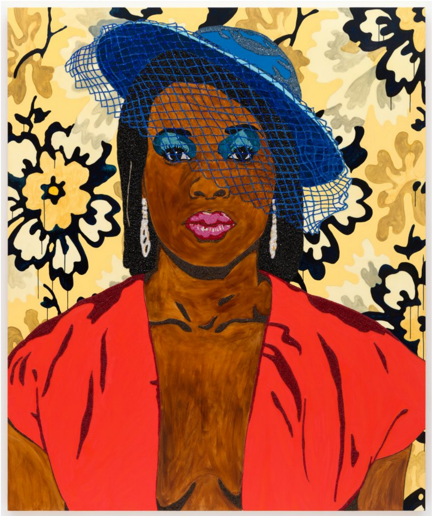
Mickalene Thomas, "Qusuquzah, une très belle négresse 1" (2011)