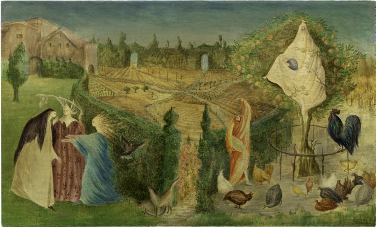
Leonora Carrington, "The Kitchen Garden on the Eyot" (1946) Photo: © Estate of Leonora Carrington

That's why I'm encouraged to see that six of the 11 works were made in or before 1960. The others are more contemporary, though only three were made in this century.