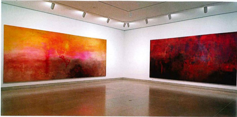
From left: View of "Frank Bowling: Map Paintings," 2015, Dallas Museum of Art. From left: Texas Louise, 1971; Marcia H Travels, 1970. Melvin Edwards, Pyramid Up and Down Pyramid, 1969, barbed wire. Installation view, Nasher Sculpture Center, Dallas.