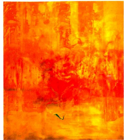
From left: View of "Melvin Edwards," 1970, Whitney Museum of American Art, New York. From left: "Look through minds mirror distance and measure time"—Jane Cortez, 1970; Curtain for William and Peter, 1969. Frank Bowling, Middle Passage , 1970, acrylic on canvas, 10' 7¼" x 9' 2¾".

fashion and current art convention to 'signify' something different to someone who grew up in Watts rather than to 'signify' only in the meaning of Jack Burnham and his colleagues."