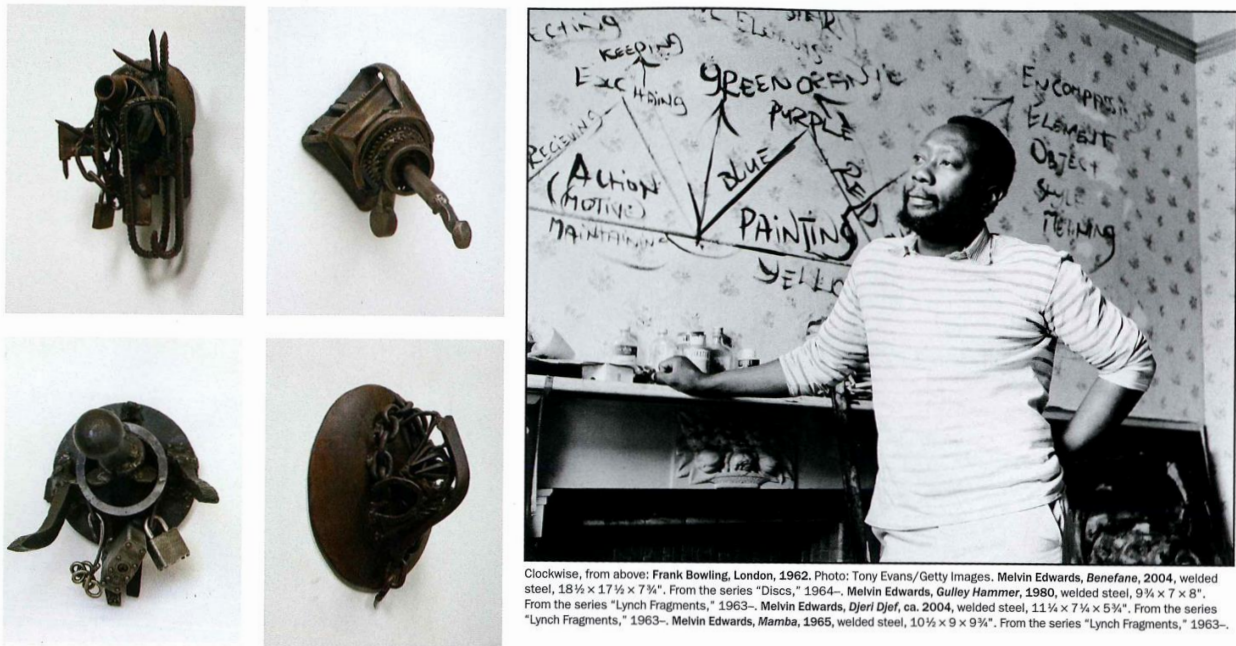
Clockwise, from above: Frank Bowling, London , 1962. Melvin Edwards, Benefane , 2004, welded steel, 18 1/2 x 17 1/4 x 7 3/4". From the series "Discs," 1964-. Melvin Edwards, Gully Hammer , 1980, welded steel, 9 1/4 x 7 x 8". From the series "Lynch Fragments," 1963-. Melvin Edwards, Djeri Djef , ca. 2004, welded steel, 11 1/4 x 7 1/4 x 5 1/4". From the series "Lynch Fragments," 1963-. Melvin Edwards, Mamba , 1965, welded steel, 10 1/2 x 9 x 9 3/4". From the series "Lynch Fragments," 1963-.

an aerial view of a mountain range, presumably because the canvas was crinkled or rippling as acrylic paint washed over its surface. Here and there on all the canvases paint creates a terrain of rivers and tributaries. Scanning these imaginary landscapes, one feels the hold of preconceived notions about the world and the systems that organize it loosening.