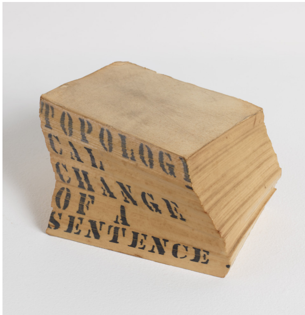
Topological Change of a Sentence , 1966, pen, vinyl glue, and acrylic, 3.63h x 7.38w x 5.88d in (9.22h x 18.75w x 14.94d cm), unique