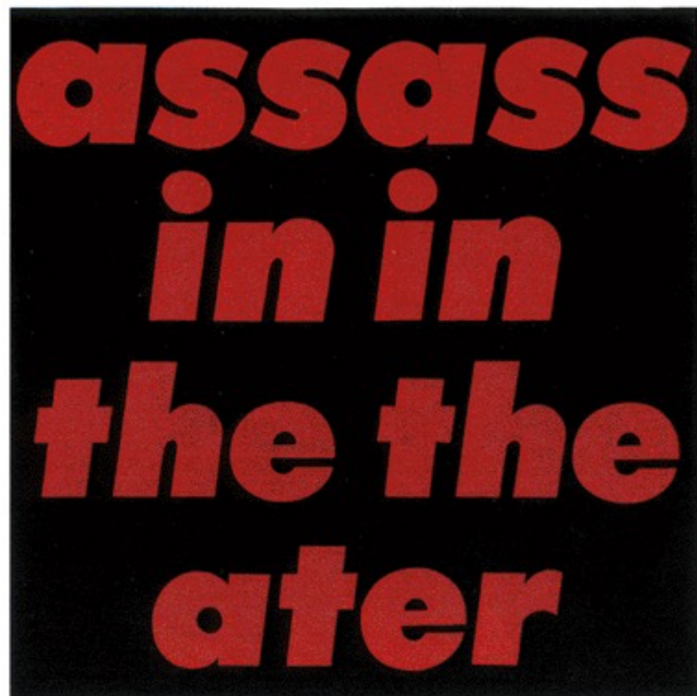
Kay Rosen, John Wilkes Booth , 1987, enamel sign paint on canvas, 20 x 20".

how they sound—Rosen also deploys the margins of the canvas, the lack of space that breaks a word. These interstices that splinter language, these interactions between language and the space of the canvas and then the space of the wall, are critical. In Tree Lined Street , 1989, for example, the left and right margins shave off slender verticals from the title phrase and abbreviate the last word by two letters, leaving pictorial rows of trees on either side of the central street line.