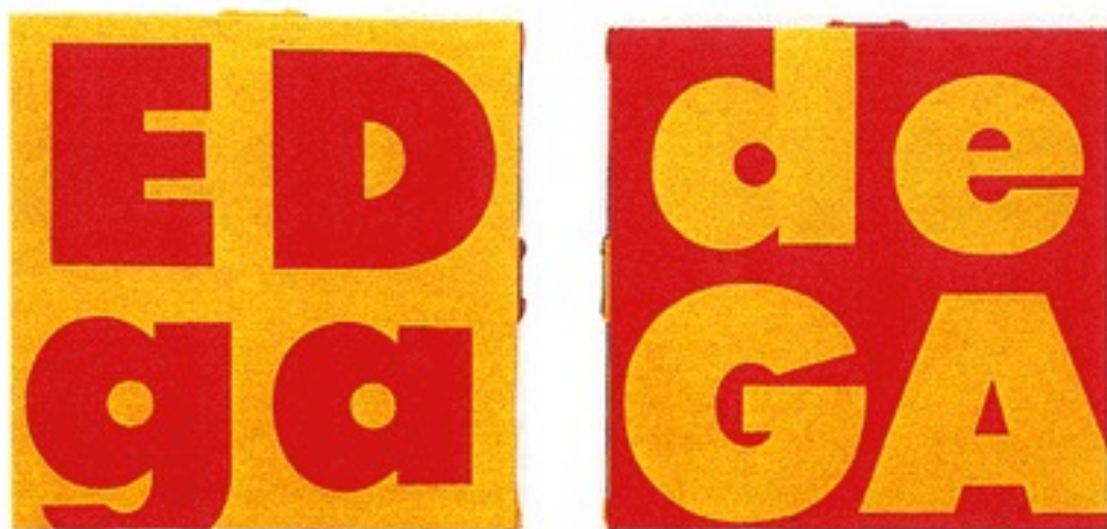
Kay Rosen, Edgar Degas , 1987, enamel sign paint on canvas, diptych, each canvas 10 x 10 x 2 1/4".