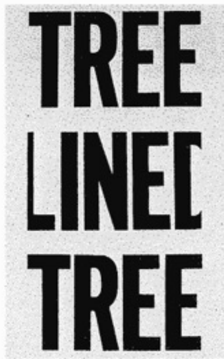
Kay Rosen, Tree Lined Street , 1988, enamel sign paint on canvas, 16 x 12".

Rosen is a disciplined editor, using analogy and resemblance, mirror images and inversions, to fabricate the unimagined from the most mundane and undervalued bits of speech. Her language is remarkable in its variation. In t-h-w-a-r-t , 1989, a phonetic spelling of the letters of the title articulates a message that can be read as a garbled injunction to teach art, an activity that Rosen implies can be subversive. In his L.H.O.O.Q. , 1919, Duchamp translated the sound of a French sentence into letters that the viewer then translates back into the original words; in t-h-w-a-r-t , letters are translated into sounds, which, written out, suggest a completely new phrase. Often visual puns, typographical ascenders and descenders, mirror images, and doubled letters echo in verbal puns. But juggling letters like motifs—how they look as they repeat, and