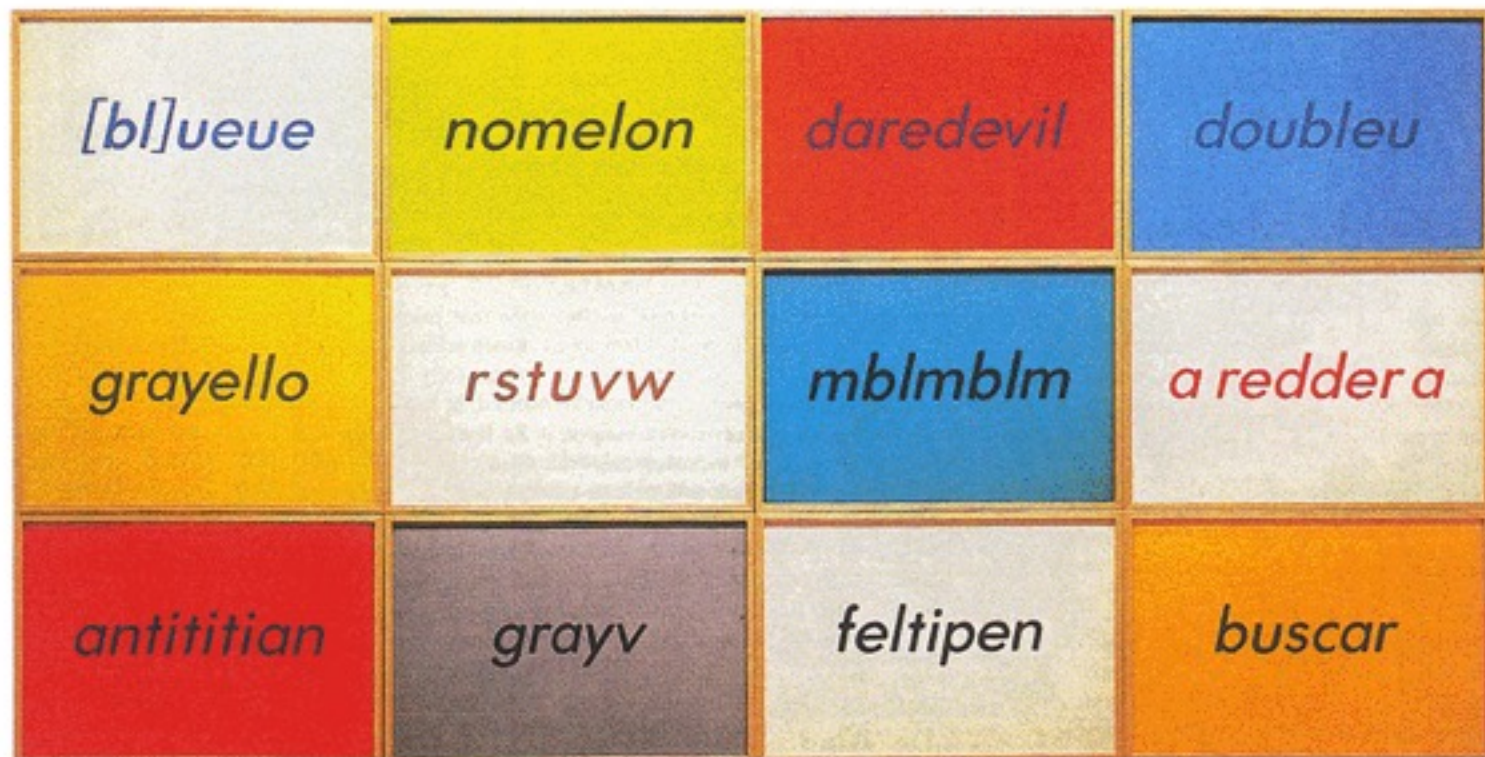
Kay Rosen, 12 works, 1990, gouache and/or sign paint on paper, each canvas 20 x 30". Installation view.

"AIDS" was followed by a dictionarylike chain of interpretive terms suggesting not illness but assistance. For an exhibition at the Lesbian and Gay Community Center, New York, in 1989, Rosen invented the word "homophonia" as a label for an ongoing alphabetical list of words and clichés, including linguistic readymades that contain two like structures, repetitions of identical letters or syllables, for example mimicry , taffera , tirllating ; gently and obliquely, this collection attempts to familiarize sexual choices that have been forced to the margins. Kristeva's observations on "Clarity, Night and Color" in language are relevant to Rosen's strategies: "A work where the subject is not 'empty' under the appearance of multiple meaning, but is a 'surplus of subject' exceeding the subject through nonsense, in contradiction to which a symbolic formality comes along to posit the meaning(s) as well as the subject." 6