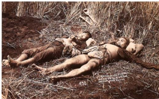
Postcard, circa 1905. “Moros killed during attack on Company ‘D’ 6th Infantry Outpost near Pantar.”

ical violence.) Central to Buried Pig is the American identification of the pig blood method. The Pershing legend, in which juramentados (Muslim insurgents who took a vow to kill Christian infidels) were terrified of the consequences that being buried in contact with this impure animal would foreclose the afterlife, claimed that the fear it struck in the heart of Muslims secured peace in the Muslim South for four decades. The identification of a point of vulnerability of the juramentados was especially welcome to American occupiers since the Filipino Muslims were notoriously hard to kill—indeed a new and larger standard-issue gun had to be invented during the Philippine-American War to