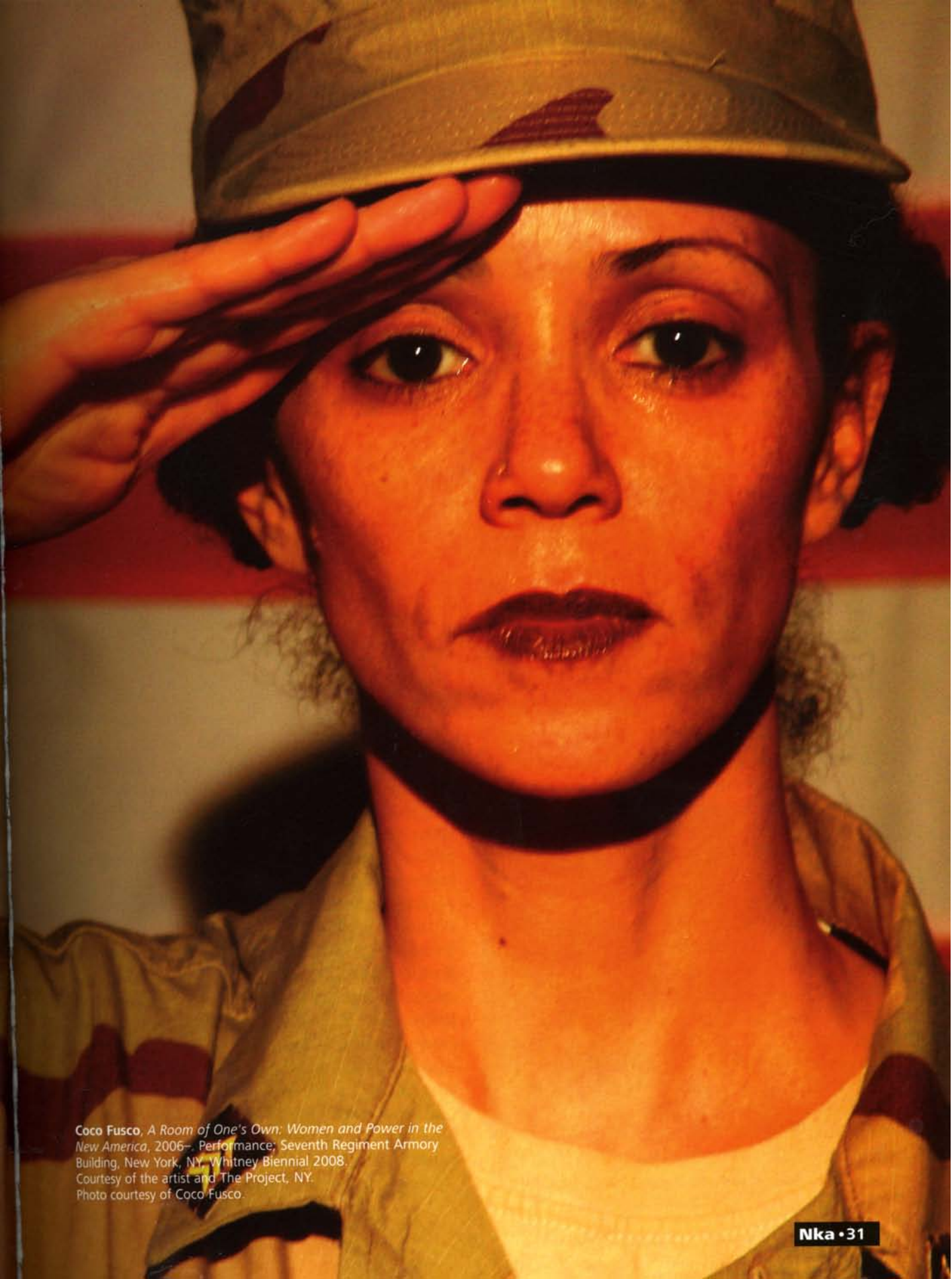
Coco Fusco, A Room of One's Own: Women and Power in the New America , 2006–. Performance; Seventh Regiment Armory Building, New York, NY, Whitney Biennial 2008. Courtesy of the artist and The Project, NY.