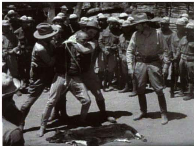
Film still from The Real Glory (1939), Production: Samuel Goldwyn, Director: Henry Hathaway. Starring Gary Cooper, Andrea Leeds and David Niven. Based on a novel by Charles L. Clifford.