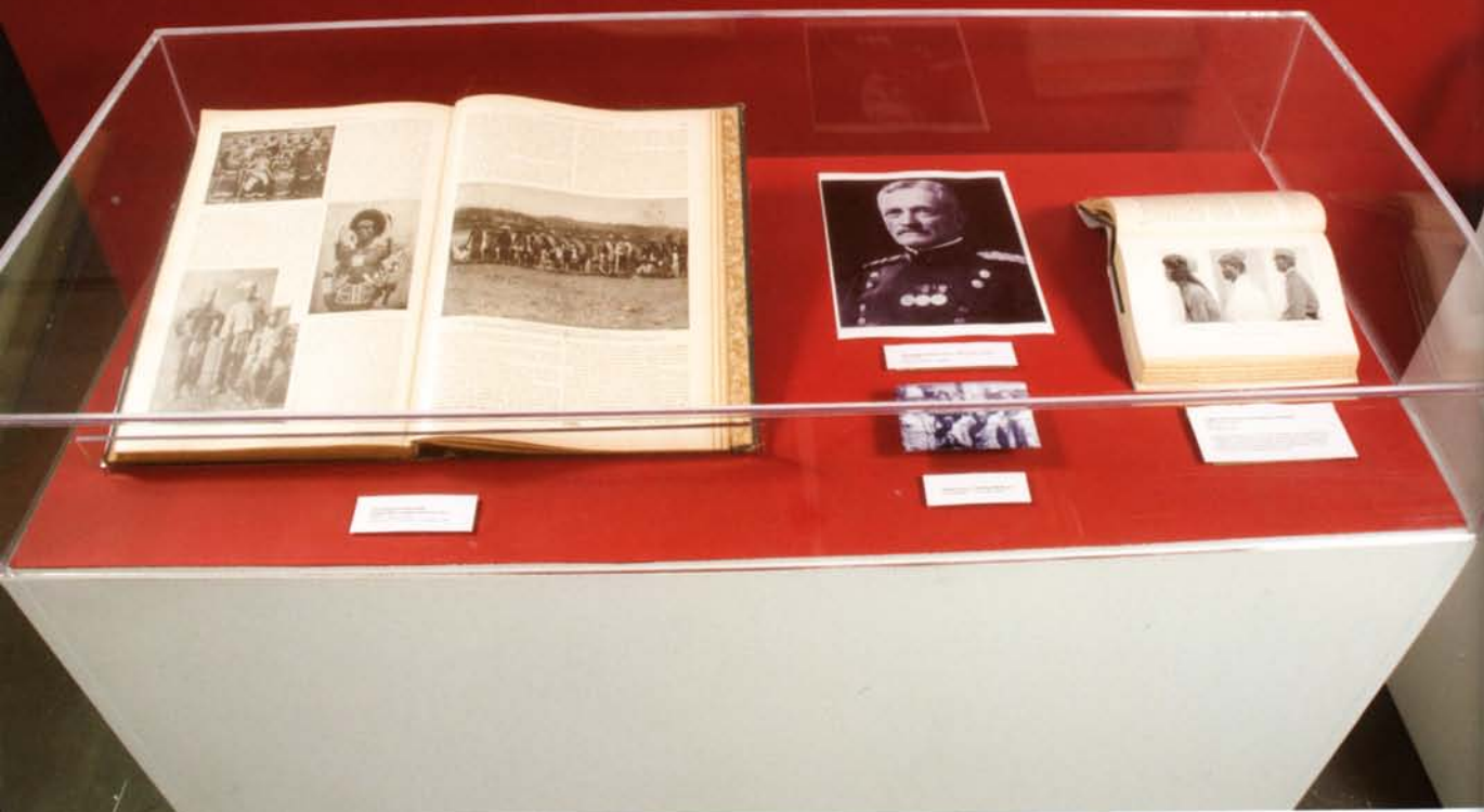
Coco Fusco, Buried Pig with Moros , 2008. Installation view.

Fusco's work seems to place the mainstream Chelsea-ified, China-ized, Modernism-ist concerns of contemporary art somewhere beneath the threshold of contempt. A careful consideration of Fusco's current work including the documents selected to foreground aspects of the little-known, but profoundly significant Philippine-American War (subsequently called "the first Vietnam") allows for the locating and tracking of certain cultural vectors of aggression that are today constitutive of state power. 2 These vectors, while no less deadly than more commonly understood forms of state-sanctioned violence (including the deployment of armies, police actions, and the dropping of bombs), implicate cultural practice, and more pointedly perhaps, cultural practitioners. In a cultural space, Fusco's assemblage in Buried Pig clearly makes visible historical precursors to the racist