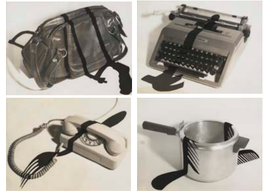
Enigma series, 1981, photogram, 11-2/5" x 15-2/5" each

Alexander Gray Associates is pleased to announce Regina Silveira's first exhibition with the gallery. A key influencer in the development of Latin American contemporary art, Silveira has exhibited since the 1970s. Through installation, sculpture, print and photography, she is renowned for her parodic explorations of perspective and cast shadows. Silveira's work is celebrated for its conceptual rigor and formal impact. Her art has considered the ephemeral nature of the sculptural object, dissolving space and time. Utilizing technology and graphic manipulation, she has invented a formal language that has been manifested in- and outside of the gallery context, including large-scale public installations.