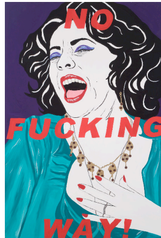
No Fucking Way: from the Liz Taylor Series (Who's Afraid of Virginia Woolf) 2006 Acrylic, and mixed media on canvas 90" x 60"

Alexander Gray Associates is pleased to present an exhibition of paintings from Kathe Burkhart's celebrated Liz Taylor Series . Since 1983, Burkhart has appropriated images of Elizabeth Taylor, transforming a mediated icon of femininity and beauty into a force of feminist resistance and self-empowered eroticism. Kathe Burkhart is a prolific artist and writer, whose art crosses disciplines, including painting, drawing, photography, sculpture, installation, video, performance, fiction, non-fiction and poetry.