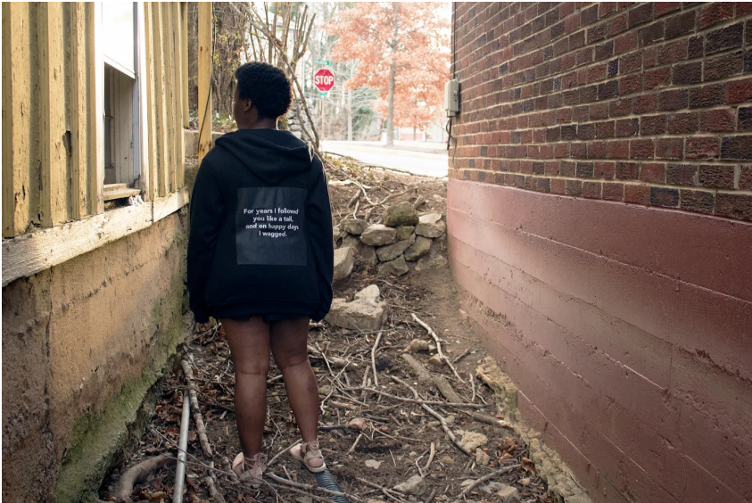
The Book of Everyday Instruction, Chapter Eight: Complete upon arrival (Student), 2018.

The title of the book, The Book of Everyday Instruction , is the title of the project. It's funny to me that a project that had "book" involved in the conceptual structure is now becoming an actual book. I don't remember how I landed on this title initially. Like many of my other titles, I think it revealed itself to me as an exciting turn of phrase, and then I structured the work, in some sense, around living up to that idea. Also, when I googled "Book of Everyday Instruction," one of the first things that came up was Proverbs, a section of the Bible. I'm not religious, but I do think the way we organize around and through religion has a lot of interesting intimacies bound up in it, so sticking with something vaguely Biblical seemed appropriate. What is the ultimate pairing if not the fraught relationship between person and god?