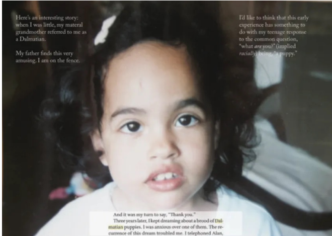
from "Obligation To Others Holds Me In My Place" (Dalmatian Narrative), 2018

In general, my work is project-based, and doesn't really exist as independent entities. What took me a bit longer to decide — or even to understand — is how my various projects are connected to each other, and are, in fact, all part of the same body of overall thought and research. All of my work investigates intimacy. My projects are gradually increasing the scale of that intimacy. I started with the self (The Bureau of Self-Recognition, 2011–2013). From 2015–2017, and ending with this book in collaboration with the Operating System, I'm working with the pair (The Book of Everyday Instruction). In early 2018 I started an investigation of immediate family units, tentatively titled Obligation to Others Holds Me in My Place. By growing the work in this way, I hope to see what carries over as group sizes get larger: where does intimacy hold, and where does it break? What might surprisingly be the same between a million people as it is between two?