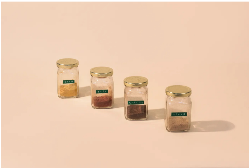
The Book of Everyday Instruction, Chapter Six: What is shared, what is offered (Four Phases of Love: Scent), 2017.

This is a huge topic, and one that I think about a lot. I'm not sure that we're very successful at doing this with any objects that require purchasing except, maybe, things like paper towels. I know that not everyone uses paper towels for a variety of reasons (cost, sustainability, and so on), but we know what they are. So they have a kind of meaning in our minds that's associated, maybe, with utility. And even if we don't, or can't buy paper towels, this is because we have specific reasons not to, related to our understanding of what paper towels are used for, their cost, and so on. We're not forming ideas against them in the abstract. How do we get art to do that? How can art be useful, and something that people know about and respond to because it's known, even if they decide they still don't want it, or can't have it? How can we do that for each of our projects individually, as well as for the idea of Art or Poetry more generally? I want to be as good as paper towels. I mean they're really not sustainable but I think they're pretty good at a lot of other stuff. I would reach a lot of people, both ones who are like me, and those who aren't, if I had a more paper towel approach.