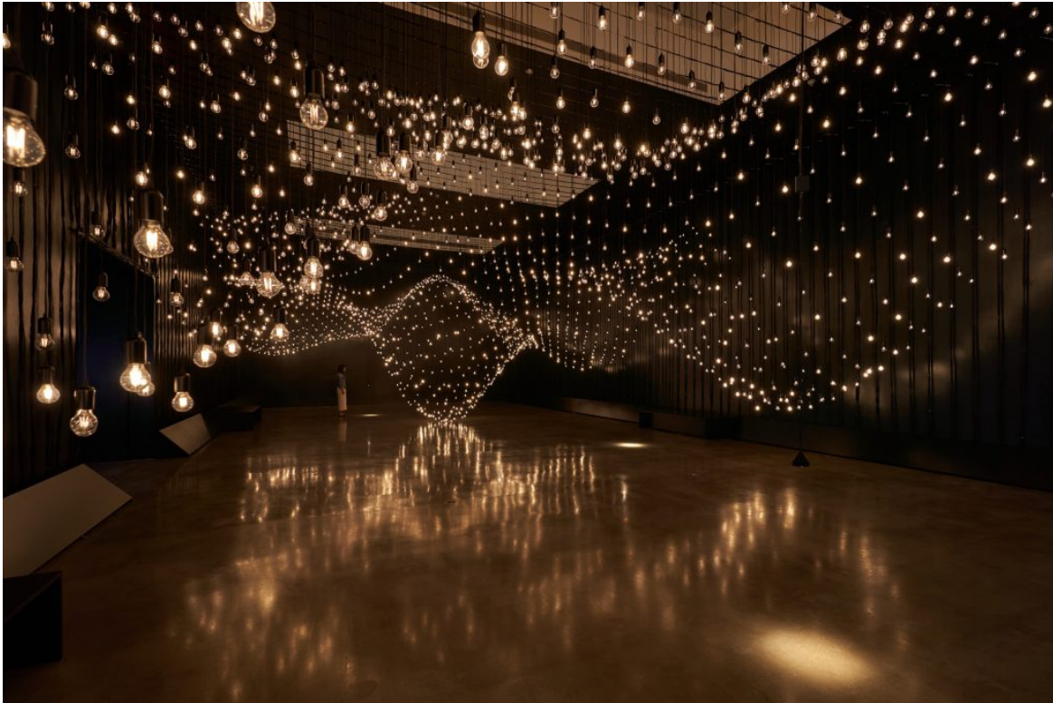
Rafael Lozano-Hemmer, Pulse Topology (2021) is currently on view at Superblue in Miami.