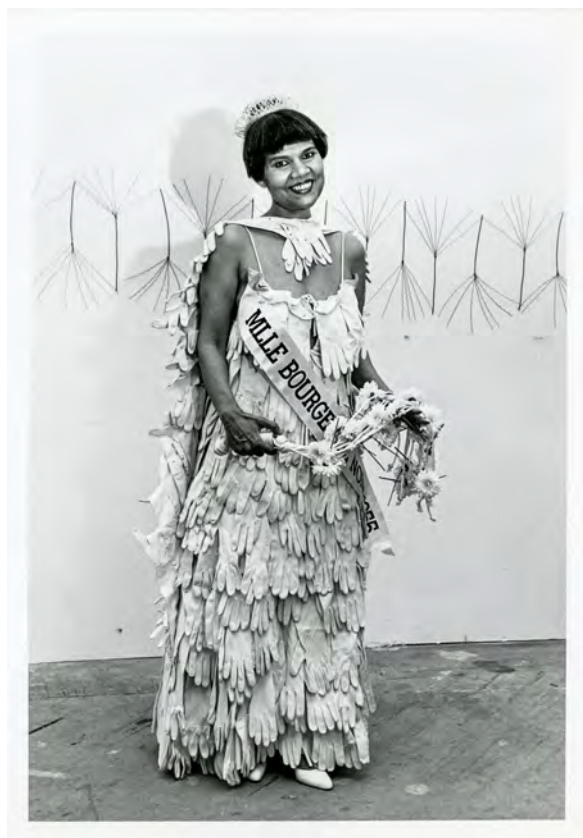
Lorraine O'Grady, “Untitled (Mlle Bourgeoise Noire),” 1980.

In 1980, because of a 300 percent rent hike, the gallery was forced to relocate. It ended up at 178-80 Franklin Street in TriBeCa. Now, with more square footage and surrounded by a burgeoning number of other “alternative” spaces, including Franklin Furnace, Exit Art, the American Indian Community House, and the Basement Workshop, collaboration took on a different cast. One of the first exhibitions at the new JAM invited neighboring arts organizations to exhibit jointly, bringing artists of Indigenous, Asian, Latino backgrounds and white women artists into this Black-centered space.