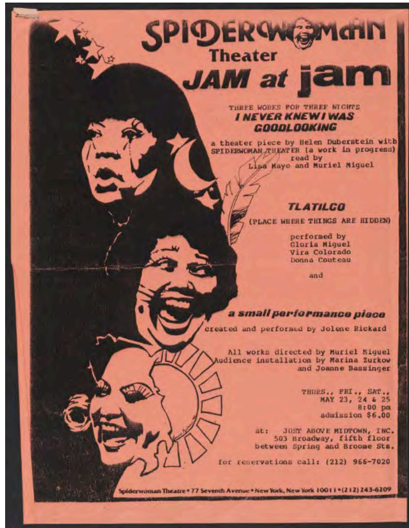
Flyer for Spiderwoman Theater's "Three Works for Three Nights," 1985. The group, a multicultural collective, had strong ties to New York's Indigenous communities.