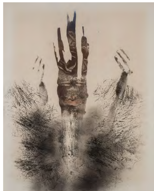
David Hammons, "Untitled," 1976. Grease and pigment on paper. "Just Above Midtown: Changing Spaces."