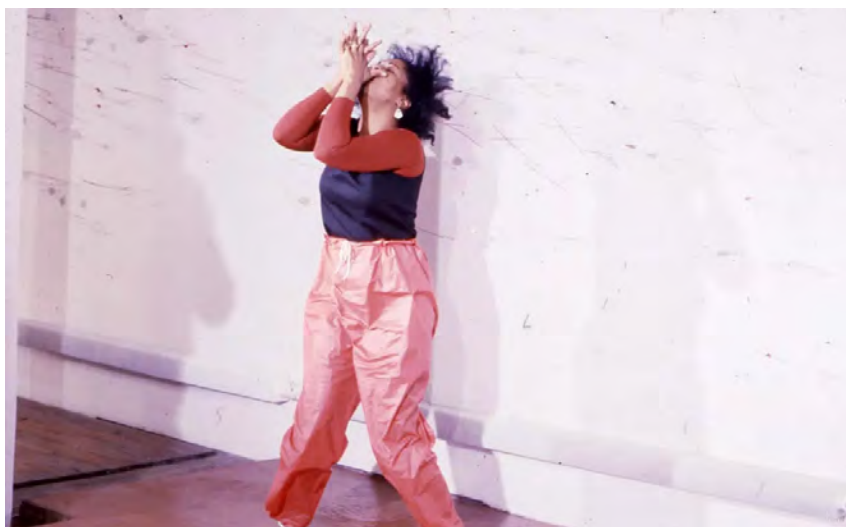
Senga Nengudi performing “Air Propo” at JAM, 1981.