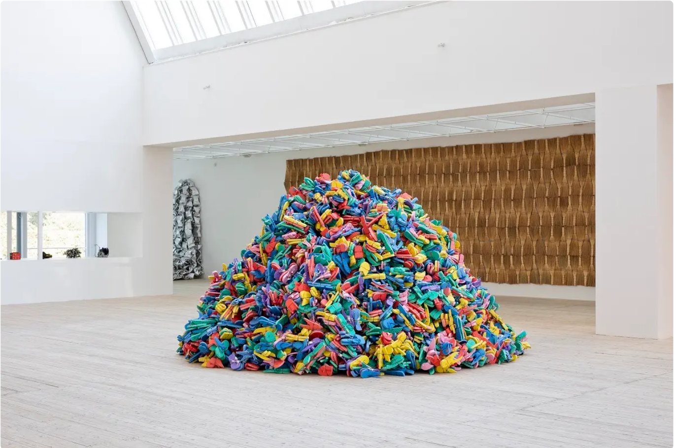
Hassan Sharif, Slippers and Wire , 2009. Installation view: Hassan Sharif: I Am The Single Work Artist , Malmö Konsthall, Sweden, 2020.

'Hassan Sharif: I Am The Single Work Artist' traces nearly five decades of the artist's multimedia practice, through over 150 works from the artist's diverse oeuvre, which range from early satirical cartoons and documentation of performances in the Hatta desert to sculptural works that were produced in the last year of his life, and emphasizes the artist's sculptural works and objects.