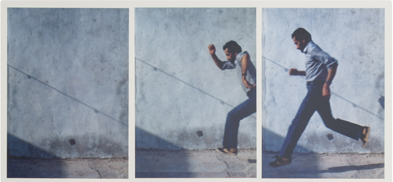
Hassan Sharif, Jumping No. 1 , 1983. 3 of 7 photographs. Collage: photographs, ink and pencil on mounting board. Photo -documentation of a performance in Dubai.

The Foundation is also custodian of Sharif's studio and personal archives. Sharif's work has also been shown in '1980–Today: Exhibitions in the United Arab Emirates,' UAE Pavilion, 56th Venice Biennale (2015); and ADACH Platform for Visual Arts, 53rd Venice Biennale (2009).