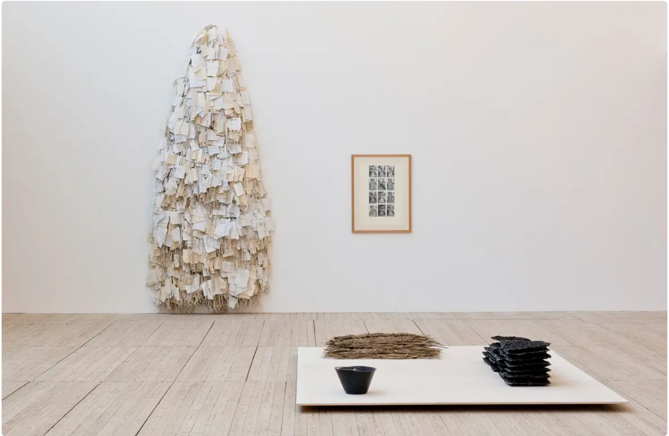
Dictionary. 1981. Photographs and pencil on mounting board and glue, dictionary pages and cotton rope. Installation view: Hassan Sharif: I Am The Single Work Artist, Malmö Konsthall, 2020. (Sharjah Art Foundation Collection.)

A pioneer of conceptual art and experimental practice in the Middle East, Hassan Sharif explored form, time, social action and mathematical systems throughout his career. His work is marked by the use of common materials in accumulative installations as well as complex social and philosophical reflection.