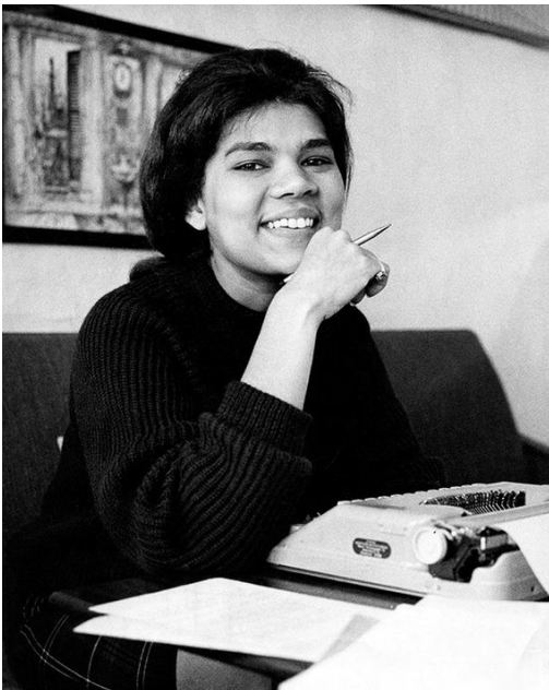
in her apartment in 1962 in Copenhagen, some time after leaving her first marriage.

Now the artist is the most visible she’s ever been — a situation that she’s still getting used to. In November, Duke University Press published a collection of her texts, Writing in Space, 1973-2019 , and the Brooklyn Museum is set to