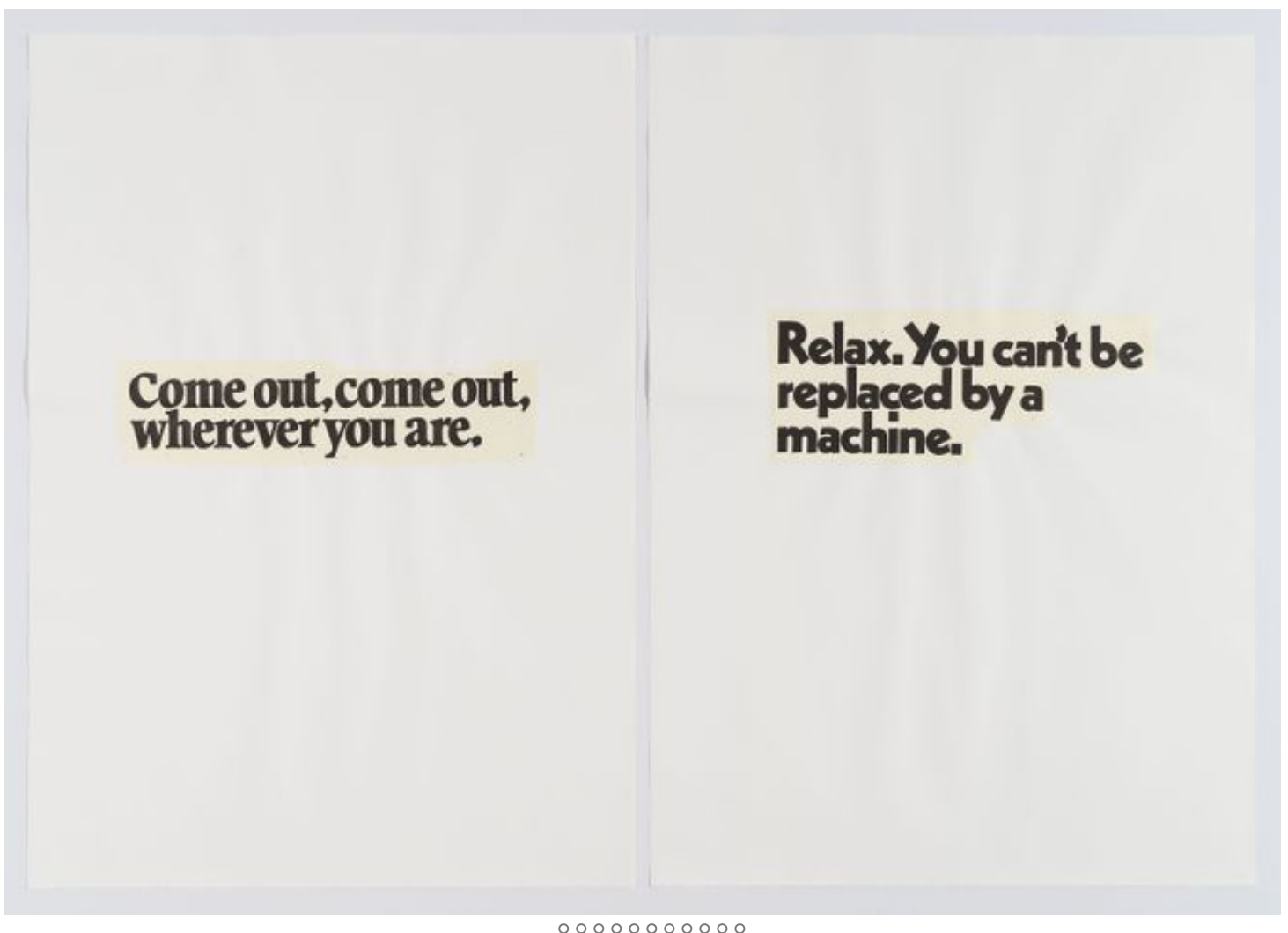
1977/2017: Lorraine O'Grady, Cutting Out CONYT 12, 1977/2017. O'Grady's first act as an artist was a series of collages called "Cutting Out the New York Times," which she made by cutting up the paper's Sunday editions. Forty years later, she reprinted and reshuffled her earlier work, creating a new series of tense, poetic diptychs.