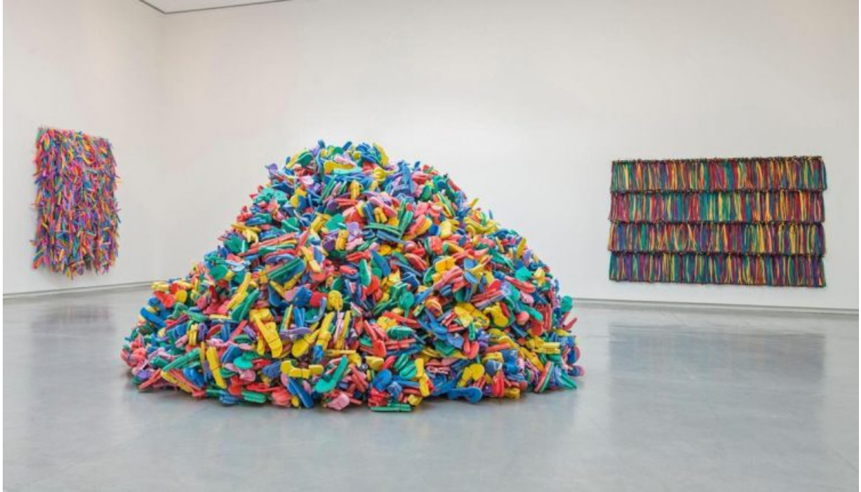
Via The National .