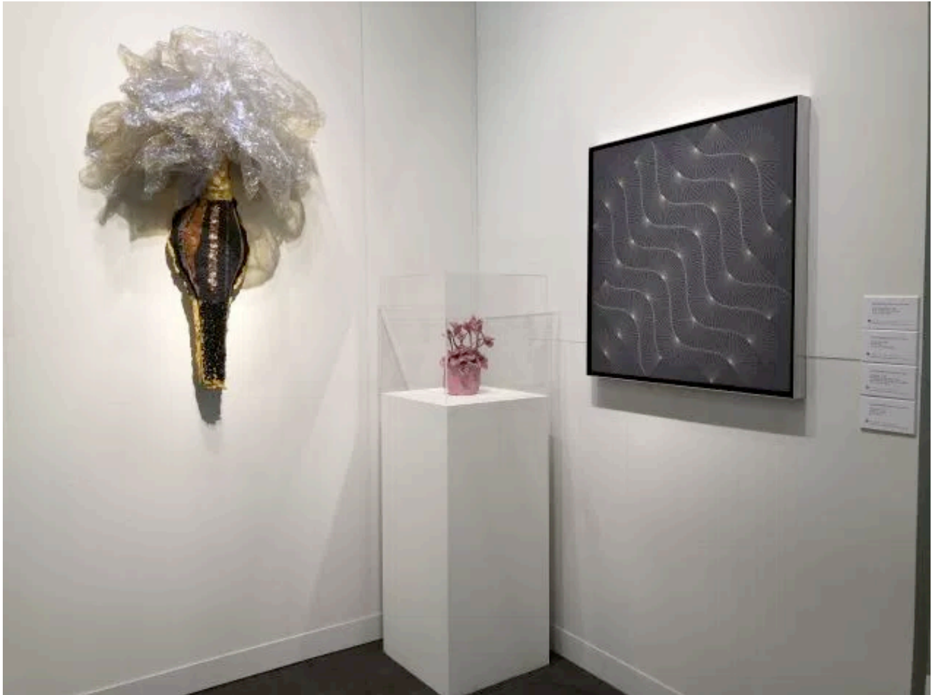
Installation view of Locks Gallery's booth.