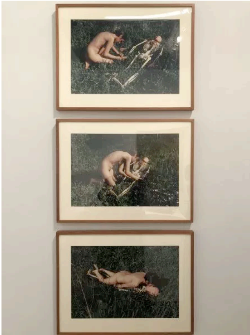
Ana Mendieta at Alison Jacques.