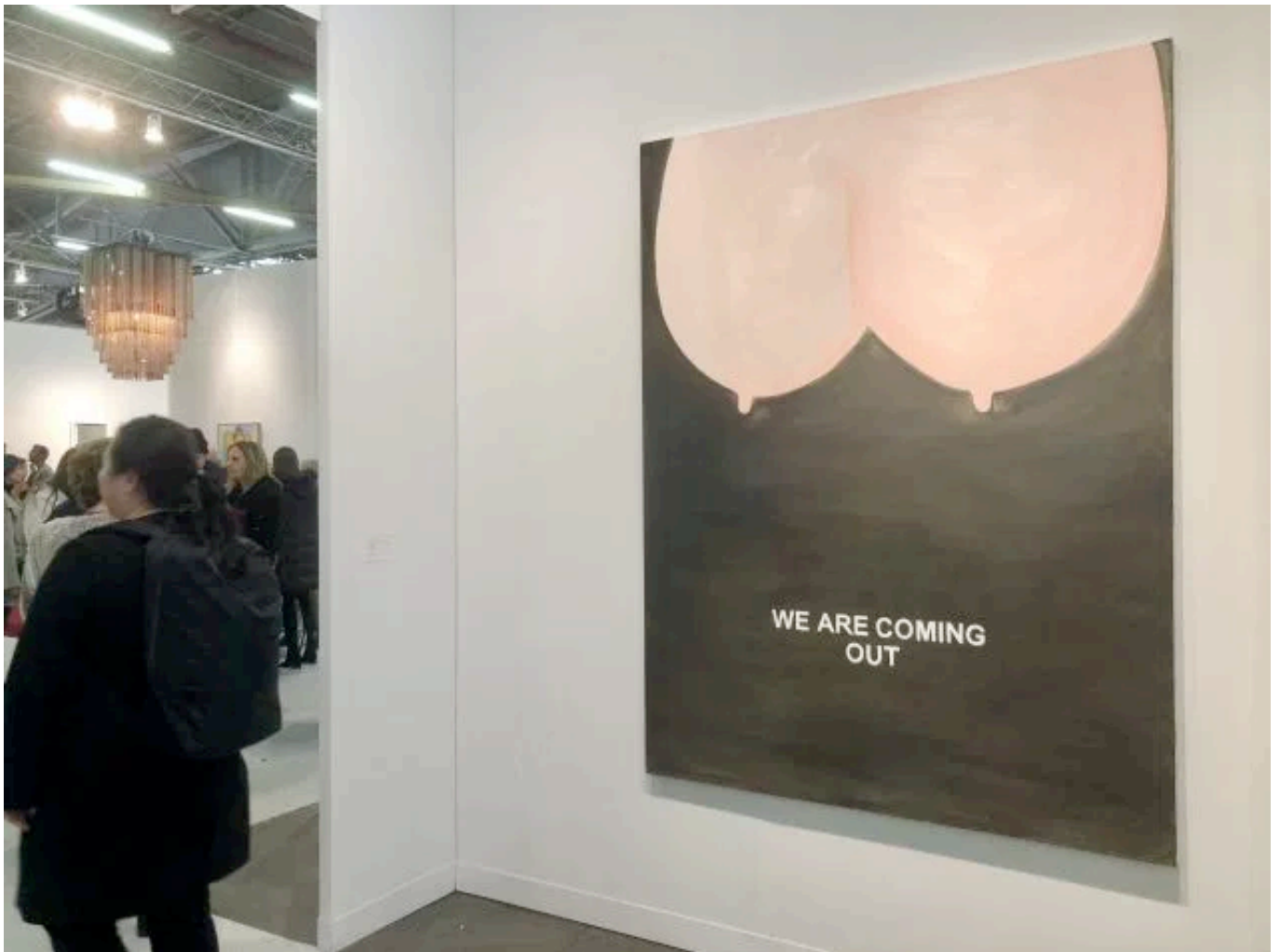
Laure Prouvost at Lisson Gallery. Margaret Carrigan

Indeed, it's tough to track the market for established female artists of the 20th century—especially those working today—since works by their male counterparts still routinely fetch higher prices and fair sales reports tend to focus on the biggest sum totals. Although by no means comprehensive, Artnet News's summary of the 2018 Armory Show's most triumphant sales had just six female artists listed among 41 male names.