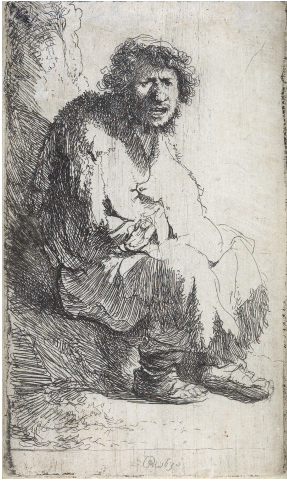
Rembrandt van Rijn "A Beggar Seated on a Bank" (1630)

This and other notable sales and acquisitions are chronicled in our latest Transactions story.