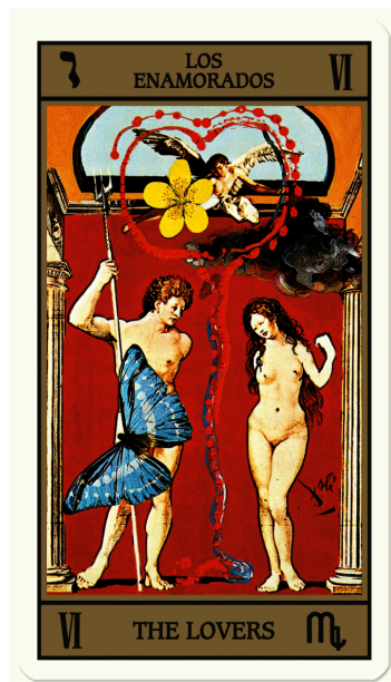
The Lovers ( © Salvador Dalí, Fundació Gala-Salvador Dalí, VG Bild-Kunst, Bonn 2019)

Nibbles, Selena Goatmez, and Vincent van Goat were among the animals that helped clear scrub surrounding the Ronald Reagan Presidential Library before the recent California wildfires broke out. In May, a herd of 500 goats created a critical fire break that enabled firefighters to hold at bay the wildfires that threatened the library.