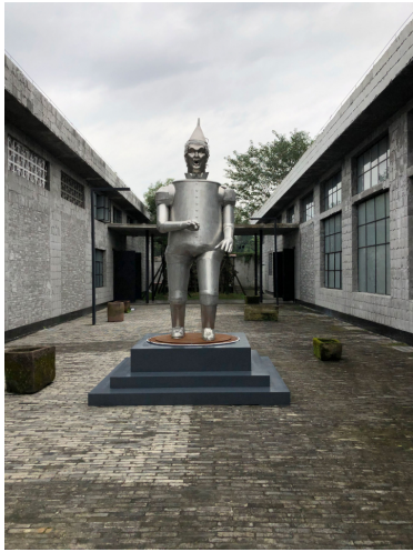
Coco Fusco, "Tin Man of the Twenty-First Century" (2018), Produced in collaboration with Chico MacMurtrie (Courtesy Tettero, Anren Biennale 2019) © Coco Fusco/Artists Rights Society (ARS), New York)

Contentious relations between the United States and China underscore the display of Coco Fusco's "Tin Man of the Twenty-First Century" at the Anren Biennale in China's Sichuan province. The artist has cast Trump as a heartless Tin Man, desperately in need of oil.