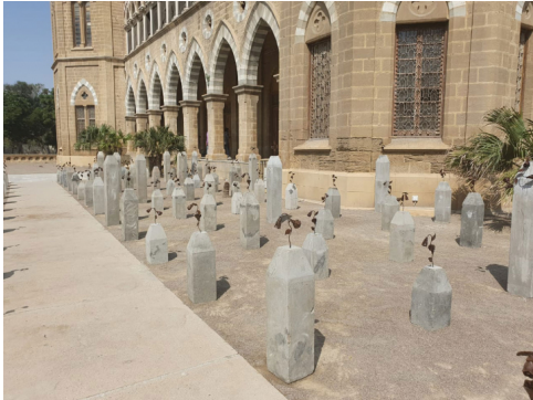
The Killing Fields of Karachi (courtesy of Adeela Suleman)

The Feminist Art Coalition has coordinated with museums nationwide to display feminist art in anticipation of the 2020 election . The project seeks to slate a fall season of intensive cross-institutional programming centered around the theme of “feminism” in its most expansive definition.