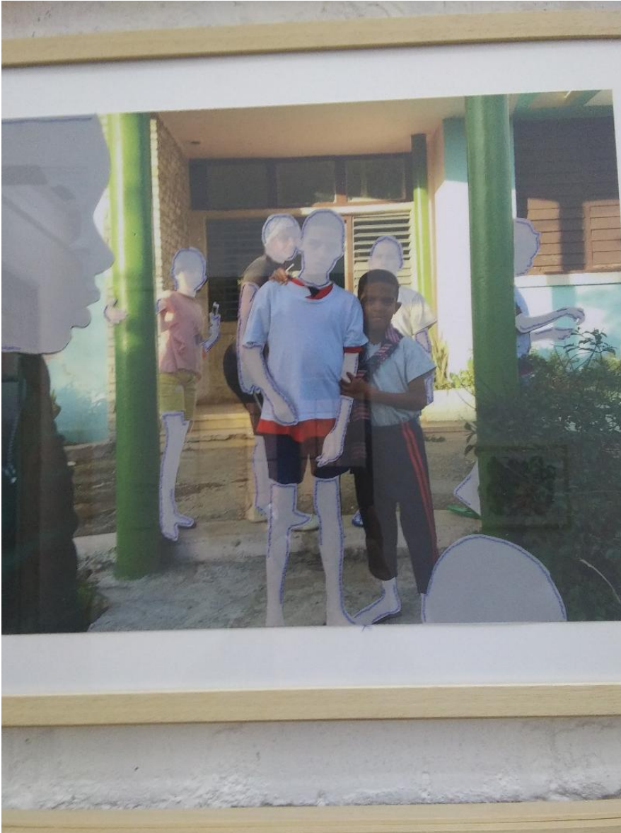
Claribel Caldeirus, "Los Niños de la Patria" (The Children of the Nation), 2019

The exhibition's objective, she writes, "is to analyze the relationship between three elements, very different but at the same time intimately connected: power, pain, and recovery."