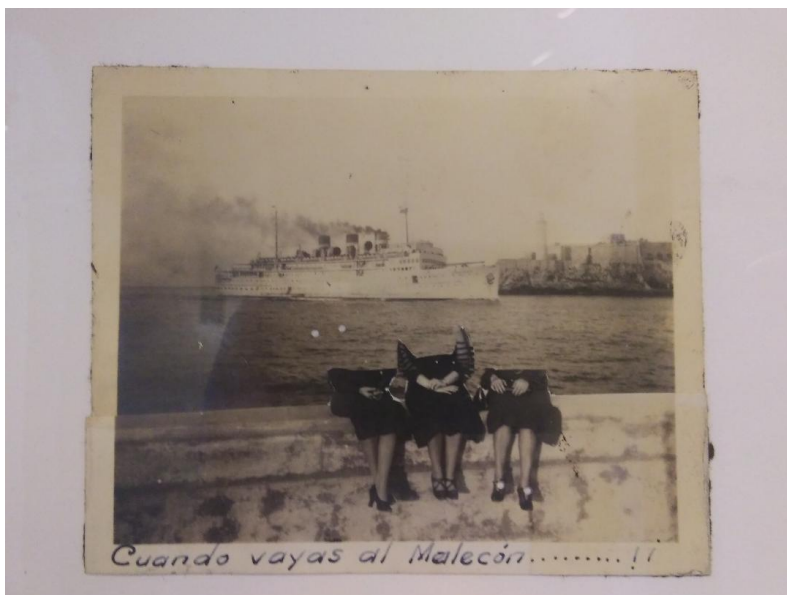
A work in the series "Cuando el recuerdo se convierte en polvo" (When Memory Turns to Dust), 2018–2019