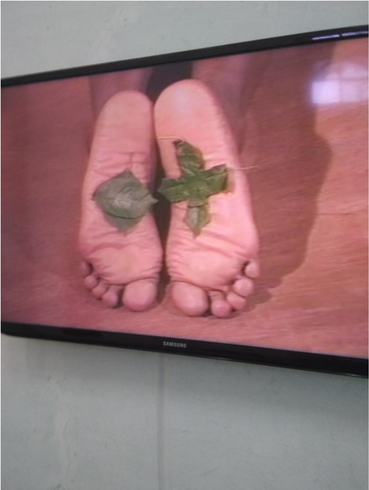
A still from "Rito de Iniciación / Baño Sagrado," 1991, a video by María Magdalena Campos-Pons