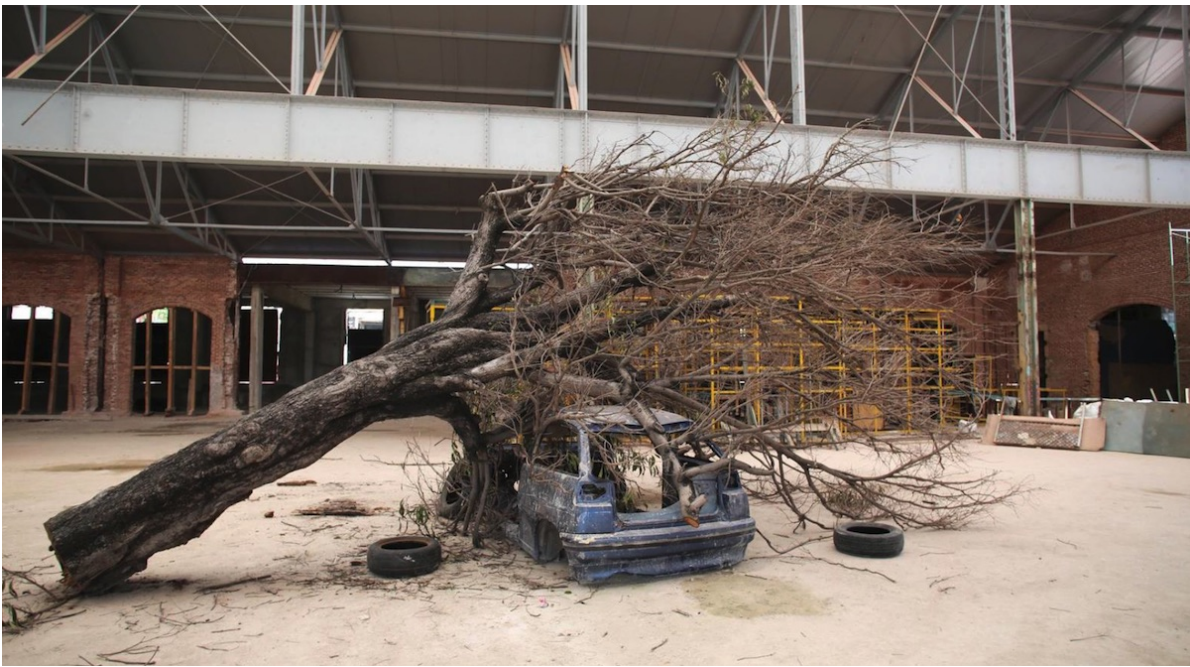
Installation view of "Mecánica Natural / Natural Mechanics," 2019, by Glenda León

Mecánica Natural consists of two groups of dead trees, divided by a wide aisle. On one side, a tree appears to have crushed a rusted-out car. It's a scene of devastation, but one in which nature is subtly winning—as shown by the addition of a lone monarch butterfly clinging to a tree branch.