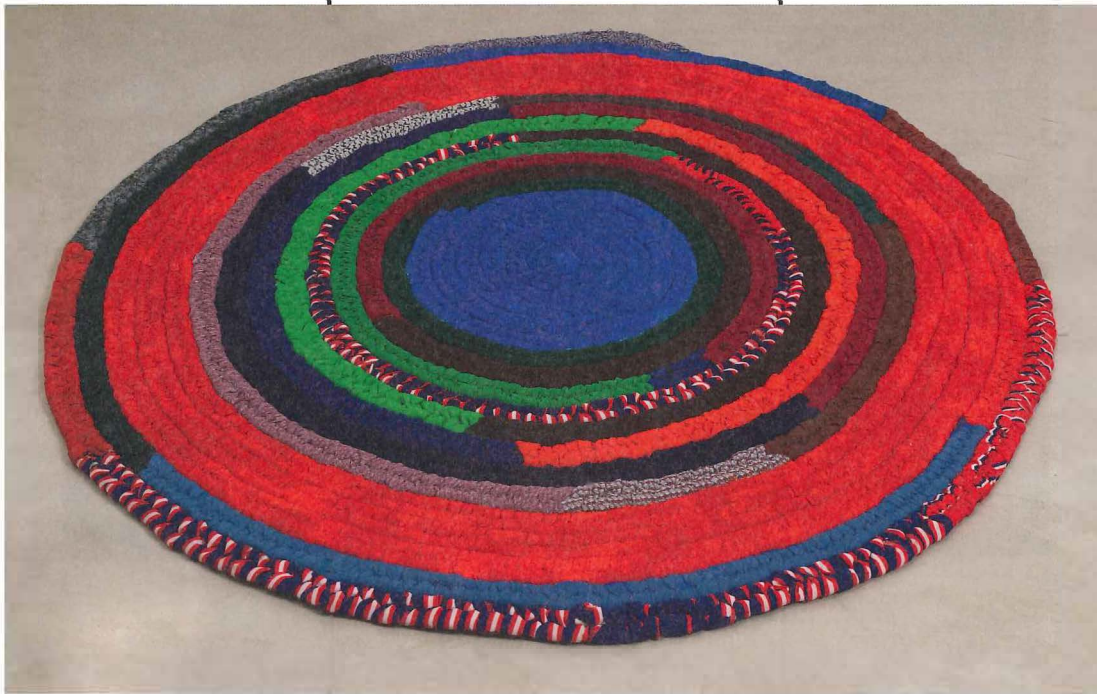
Harmony Hammond Floorpiece VI , 1973 Acrylic on fabric, diameter 165 cm

Gender stereotypes are both embraced and subverted in Hammond's work. One clear demonstration of this is found in the artist's "Floorpieces" (1973), a series of spiral carpets constructed from fabric scraps. The works allude to the iconoclastic gestures of Carl Andre, while championing the traditional women's work of weaving. However, the manipulation of gendered tropes doesn't end here, as Hammond teases the work through a queer lens with her use of a braiding method of weaving, intended to