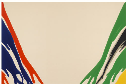
Morris Louis, “Gamma Delta” (1959–60), magna on canvas, 103 1/8 x 152 1/2 inches (© 2018 Maryland Institute College of Art (MICA) / Artists Rights Society (ARS), New York)

In a brief conversation during the press preview, Breslin told me that it was his intention to anchor the show with the works of a few household names, most notably Helen Frankenthaler, whose majestic “Orange Mood” (1966) imposes itself on the room, a cauldron of yellow, orange, and gold bordered by ice-cold slices of ultramarine, while surrounding them with paintings that might be less familiar but no less dazzling. Every one of the works in this show is worth contemplating for a good long time.