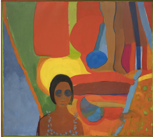
Emma Amos, "Baby" (1966), oil on canvas, 46 1/2 x 51 inches

The potency of pigment encountered in Marcia Hafif is carried into the main gallery with Josef Albers's red-and-orange "Homage to the Square: 'Wait'" (1967); Richard Anuszkiewicz's "The Fourth of the Three" (1963), a red, blue and green grid; and Ellsworth Kelly's blue and green lozenges on a red field, "Blue Green Red" (1964). The Kelly is the simplest in layout, but the most optically activated, with the three colors throbbing as rapidly as a racing heart.