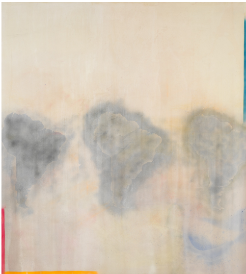
Frank Bowling, "Dan Johnson's Surprise" (1969), acrylic on canvas, 115 15/16 × 104 1/8 inches, Whitney Museum of American Art, New York; purchase with funds from the Friends of the Whitney Museum of American Art (© 2019 Frank Bowling/Licensing by Artists Rights Society (ARS), New York, all images courtesy Whitney Museum of American Art, New York, unless otherwise noted)

The eighth floor of the Whitney Museum of American Art, as David Breslin, the Director of the Collection, sees it, is “a place for surprises.”