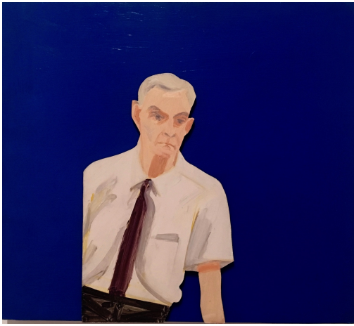
Alex Katz, "Edwin, Blue Series" (1965), oil and acrylic on composition board, 18 x 20 inches, Whitney Museum of American Art, New York; gift of the artist