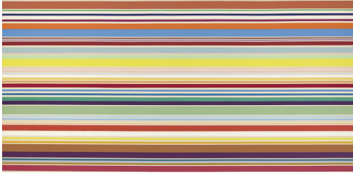
Kenneth Noland (1924-2010), New Day, 1967. Acrylic on canvas, 89 3/8 × 184 1/4 in. (227 × 468 cm). Whitney Museum of American Art, New York; purchase with funds from the Friends of the Whitney Museum of American Art

This is hardly an expression of a cool '60s aesthetic. In fact, the majority of the works in the show run hot — if not in color temperature, then in commitment.