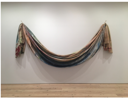
Sam Gilliam, "Bow Form Construction" (1968), acrylic and enamel on draped canvas, 119 7/16 × 332 5/16 inches

Reed is one of seven artists of color in the show, and from a historical standpoint, their works are the most revelatory due to decades of institutional biases and blind spots (though, for the record, there are no artists of Asian heritage, and the gender ratio is six women to 12 men).