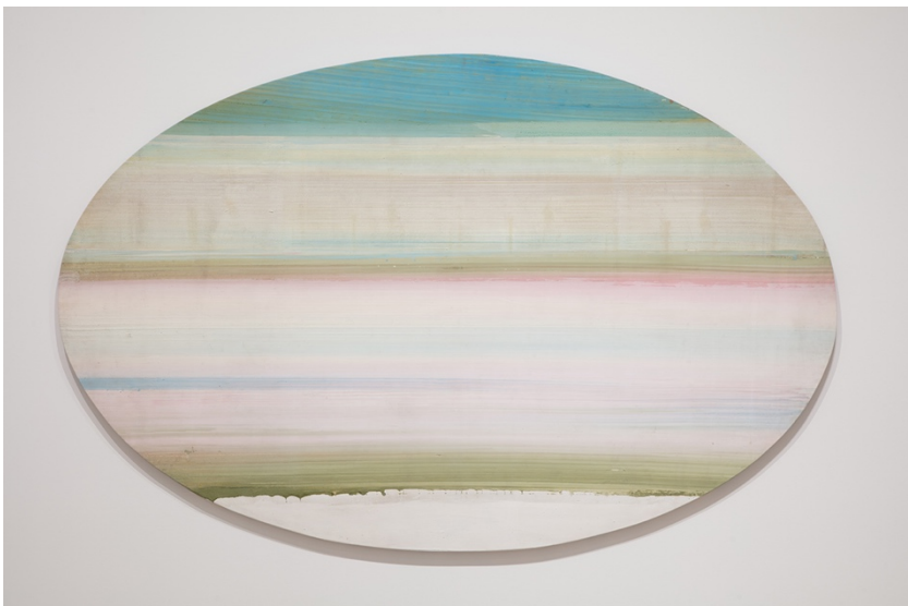
Ed Clark. Yenom (#9), Acrylic paint on canvas

The show also makes a point of accentuating the different strategies employed by the participating artists. Instead of brush, David Hammons coats himself in grease and prints his body image onto a number of works, the most powerful on view is “Injustice Case,” which depicts this inked image bound and gagged on a chair, referencing a courtroom sketch of Black Panther co-founder Bobby Seale. Rather than pursuing a clean canvas, abstract expressionist Ed Clark used a broom to sweep paint across his workspace, adding bits of dirt, hair and studio debris onto his works. Instead of a flat surface, Howardena Pindell created intriguing texture by cutting up a canvas, sewing it back together and adding hole-punched dots and sequences to the surface.