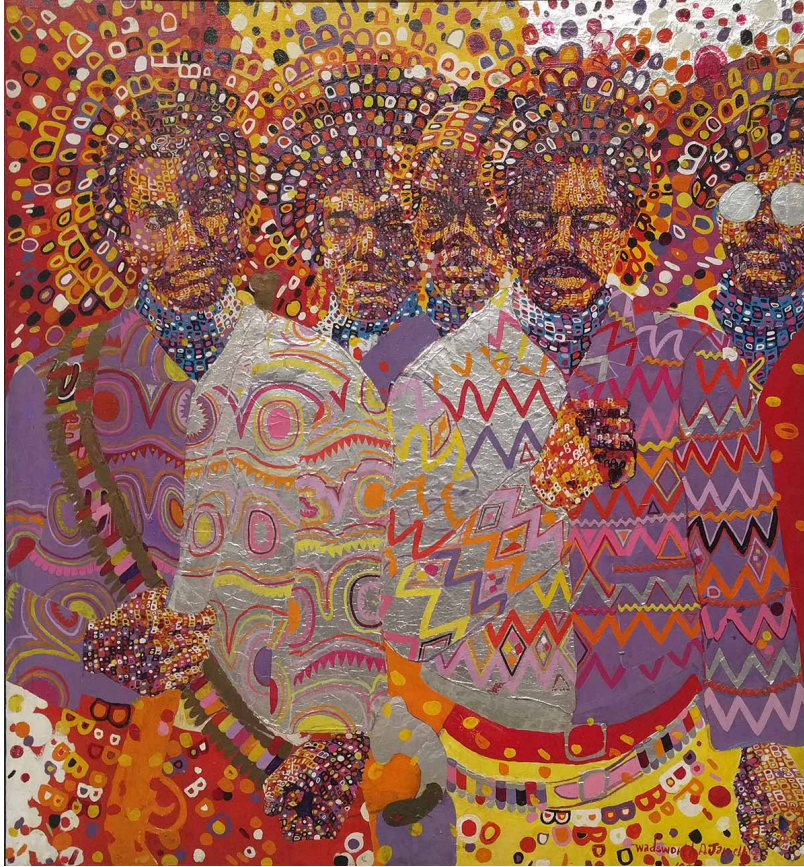
Using foil and color, Jarrell created an active, eye-catching image depicting members of Black Panther, including Huey P. Newton and Bobby Seale. Wadsworth Jarrell, Liberation Soldiers, 1972

“Soul of a Nation” also makes it a point to highlight individuals, as is the case with legendary assemblage artist Bettye Saar , who is based in L.A. The show recreates a part of Saar’s first survey show at the Fine Arts Gallery, California State University L.A. The walls of this particular section are painted a cool gray, submerging the viewer in a more mystical atmosphere perfect for Saar’s figures.