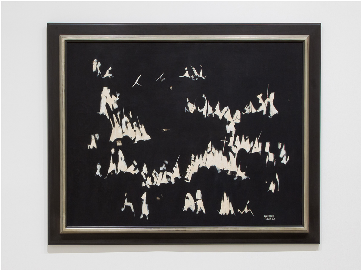
At first glance, the images seems to be just powerful strokes of black and white, but a second look reveals them to be the ghostly sight of a Ku Klux Klan gathering. Norman Lewis, America the Beautiful, 1960. Oil on canvas | Pablo Enriquez, Courtesy of the Broad

In contrast to the Spiral room's minimal black and white palette, the works of Chicago art collective, AfriCOBRA — the African Commune of Bad Relevant Artists — fairly jump out of the walls with its vibrancy and masterful use of color. Silver foil and psychedelic colors make Black Panther members shine in Wadsworth Jarrell's "Liberation Soldiers," while the dancing figures and masked drumming characters of Carolyn Lawrence's "Black Children Keep Your Spirits Free" is a reminder to parents that heritage isn't something to swept under the rug.