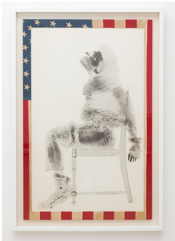
Bobby Seale, co-founder of the Black Panthers, was bound and gagged in the courtroom, after being denied the right to counsel of his choosing and the right to defend himself in court. This is the artist's rendering, inspired by the incident. David Hammons, Injustice Case, 1970, print, body print (margarine and powdered pigments), and American flag