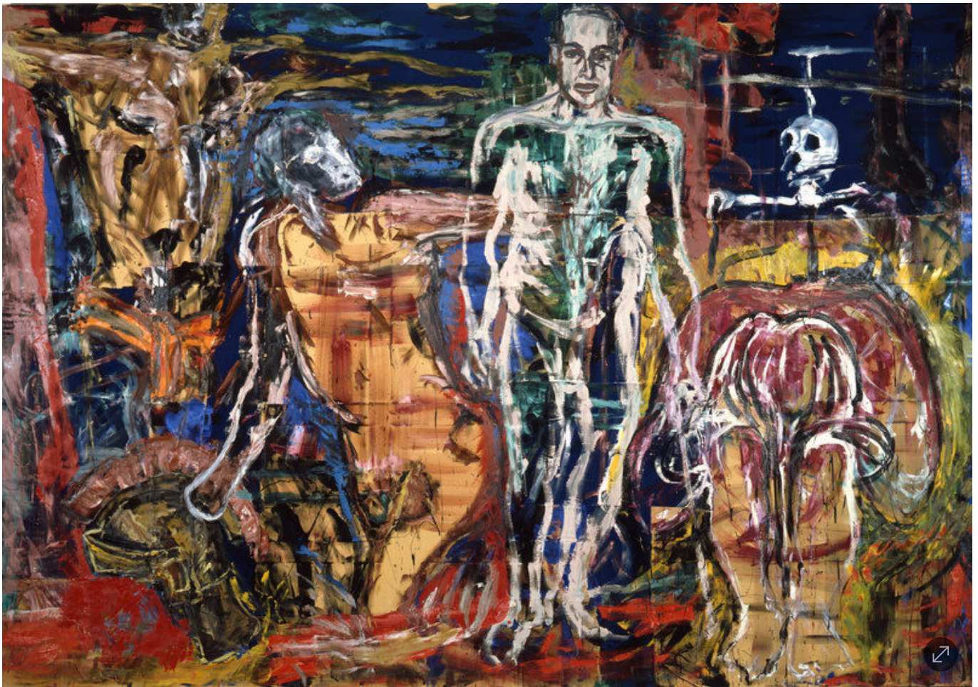
Julian Schnabel Hope , 1982