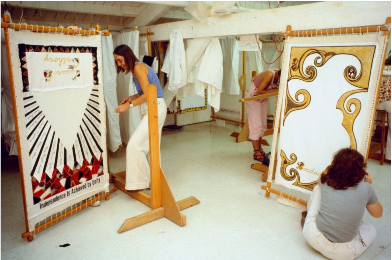
Judy Chicago "The Dinner Party" Needlework Loft, 1977 Brooklyn Museum