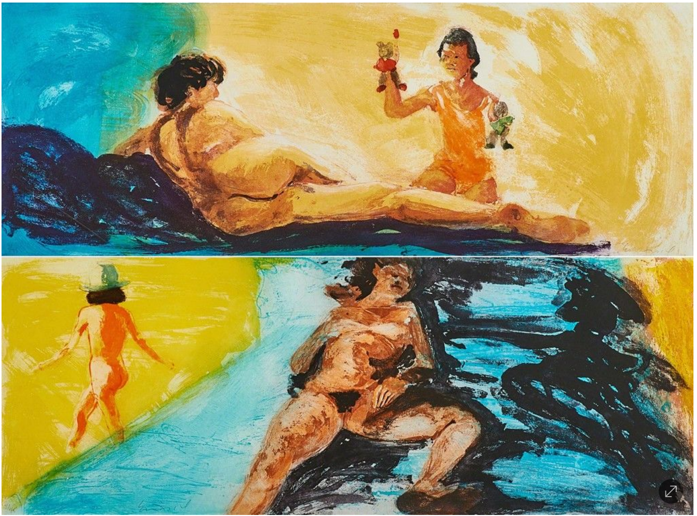
Eric Fischl Floating Islands #2 and #5, 1985 Rago

In the late 1960s and mid-'70s, the Supreme Court determined in two landmark cases that the “right to privacy” protected American freedoms like the right to enjoy pornographic materials in one’s own home and the right to have an abortion. These linked issues didn’t just affect women, of course. To think that male painters coming of age at the same time were oblivious to such national decisions is naïve and reductive—any artist interested in sexuality and the body (and many of the Neo-Expressionists were) was responding, implicitly or explicitly, to a cultural climate that was litigating pornography and a woman’s right