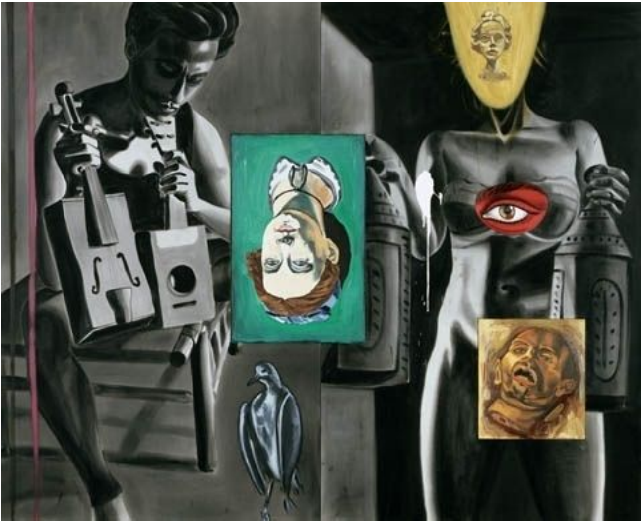
David Salle Melody Bubbles and the Critique of Reason , 1988 Mana Contemporary