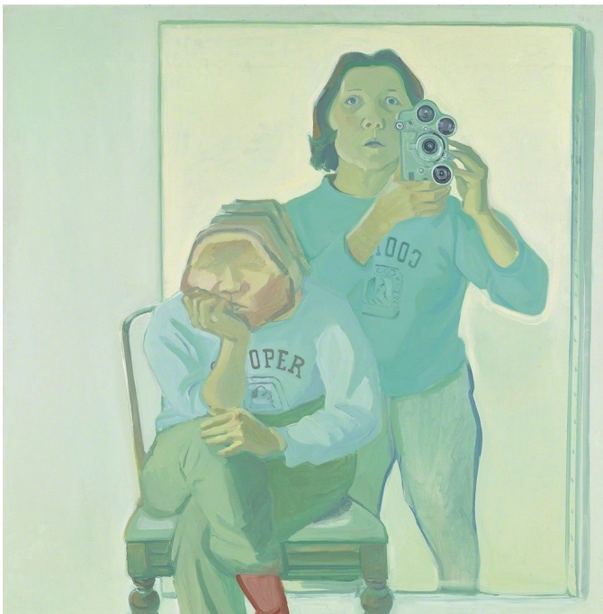
Maria Lassnig Doppelselbstportrat , 1974 Belvedere 21