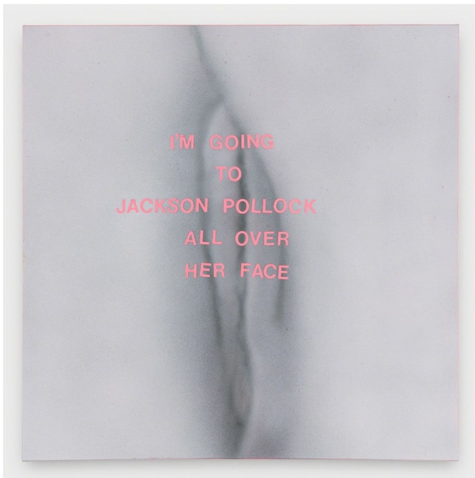
Betty Tompkins I'm going to... , 2018 P.P.O.W

for gender equality. It's notable, too, that in their engagement with photography and pornography, many female painters who exhibited throughout the 1970s preempted not only the Neo-Expressionists, but also the so-called "Pictures Generation" artists—Sherrie Levine, Cindy Sherman, and Robert Longo among them (Salle is often counted in this group). Yet few exhibitions depict such intergenerational linkages. One reason might be that all these connections form a tangled, imperfect web: It's easier to mount a show of 1980s work than extract the threads connecting the two decades.