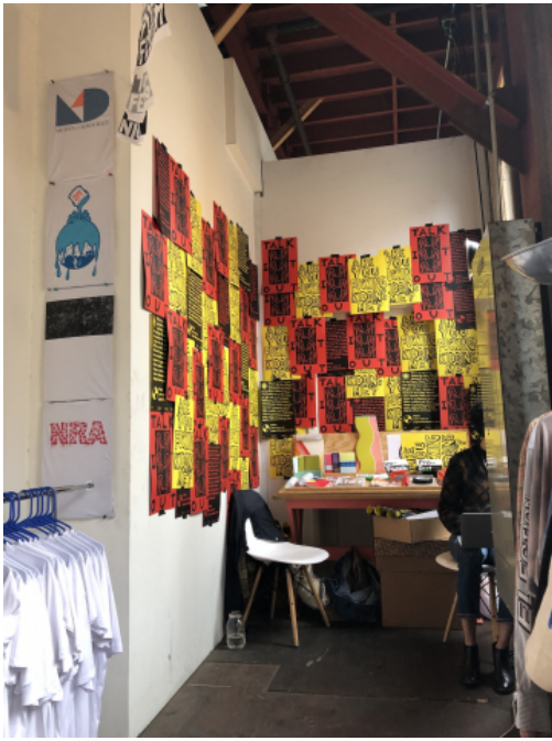
Democracy Shop presented in the backlot by Artists4Democracy

It's easy (and fun!) to hate on art fairs, but Frieze's arrival in the City of Angels represents a maturation of LA's art market, which has been developing for many years and seems to be attaining critical mass. Now there is not only Frieze, but a host of concurrent fairs around town , including ALAC, Felix, and Spring/Break. The scene here has been fertile from its beginnings in the 1950s, but while the low cost of living and freedom from European traditions made this city an ideal place to realize new ideas in art, there was almost no local market to provide support. The situation is changing rapidly, particularly with the nascent involvement of the tech industry, which until recently showed little interest in contemporary art. All this signals the increasing momentum embodied by Frieze's arrival, along with the risk of superficial production that big money always poses to the integrity and depth of art.