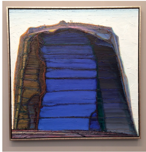
Wayne Thiebaud, "Big Rock Mountain"

Claire Tabouret at Night Gallery