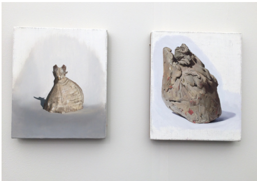
Van Hanos at Château Shatto