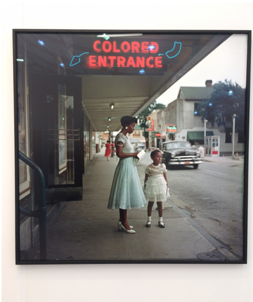
Gordon Parks at Jack Shainman