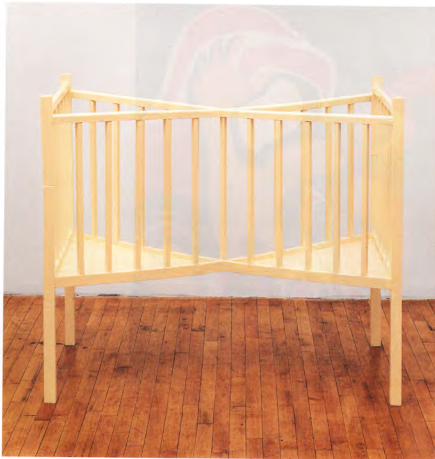
NEITHER HERE NOR THERE

I was spending time with male sculptor friends back then, who told me I had to suffer in order to be initiated into their group. That pissed me off, so I channelled my rage into my work. Around that time, there was an open call for a sculpture biennial at Parque Lage. I decided to enter the competition and was chosen – I believe I was the only woman. I proposed a copper tower with stairs and, atop the tower, a conical princess roof. Above that would be a rotating beacon, like in a lighthouse, which would illuminate the rainforest. With time, the tower would oxidize and turn green. It was a mixture of architecture and sculpture, a guiding light shining from the middle of nowhere. I fundraised to pay for its construction myself. When the biennial went bankrupt, the plan was cancelled, but my donors never asked for their money back, so I was able to use it to make more work and survive as an artist. I had no body of work at the time, but there I was with the Statue of Liberty!