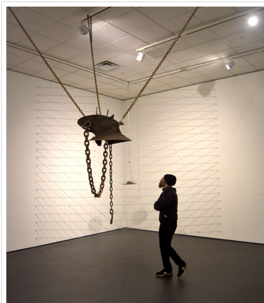
Melvin Edwards "Agricole" 2016, welded steel and chains.

The Brown exhibition includes a recreation of his 1970 piece that takes as its title a line from civil rights activist and poet Jayne Cortez (who later became his wife): “Look through minds mirror distance and measure time.” Lines of barbed wire suspended from a square on the ceiling outline (almost) a cradle or cave-like space, vaguely welcoming, but ominously prickly.