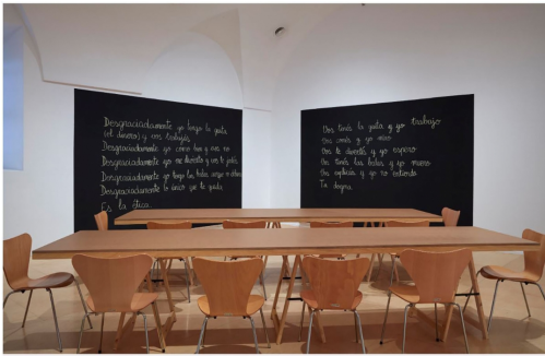
Luis Camnitzer, "Classroom" (2005)

In our interview, Camnitzer said “the ideal audience for my work are those who lived and fought during the Uruguayan military dictatorship,” which ran from 1973 to 1985. Although many of these people no longer live, they are the only ones who experienced the physical and psychological violence that his work