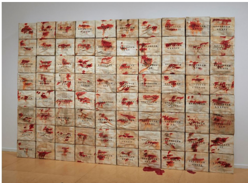
Luis Camnitzer, "Leftovers" (1970)

MADRID — At the Museo Reina Sofía, the artist Luis Camnitzer has piled up a grid of 80 blocks, approximately 12 by 12 inches each, and wrapped them in brown gauze. Imprinted with the word “LEFTOVER,” followed by a Roman number, each block appears to have been shot, dripping fake, plastic blood on the museum’s floor. The piece, “Leftovers” (1970), is an