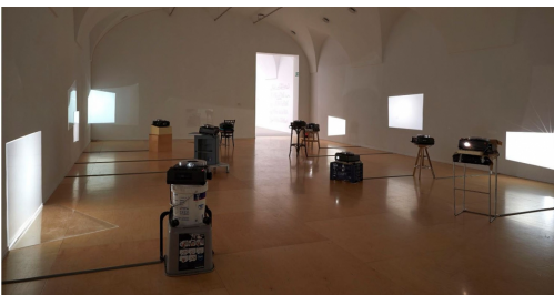
Luis Camnitzer, "Art History Lesson" (2000)

In his catalogue essay, “The Museum is a School,” Camnitzer describes the museum as a space where encounters with artworks should provoke educational moments. Education for Camnitzer does not mean learning the artistic canon of the dominant culture, but embracing the art institution as a space where conversations about our roles as audiences, wholesome humans, and our relationships to heritage and culture should take place. In this sense, Camnitzer echoes the critical pedagogies of Paulo Freire and Simón Rodríguez. At the exhibition, there is one big gallery hosting the Escuela Perturbable, a program of critical pedagogy led by artists, educators, and others through March 2019.