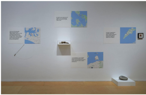
Luis Camnitzer, "About War" (2016-2018)

as a peripheral artist are those that led to the myth of New York's cultural exceptionalism: centripetal institutional practices, art world actors, and the scene's love for capital. Fortunately, this myth is now beginning to unravel.