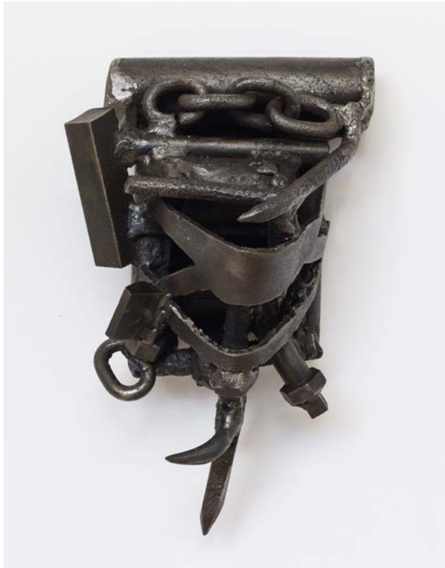
Melvin Edwards, Palmares , 1988, welded steel, 13.8h x 7w x 6.8d in (35.05h x 17.78w x 17.27d cm)

Also on view are several of Camnitzer’s etchings from his time at the New York Graphic Workshop (1964–1970). In Espejismo (1970), the artist explores both tautology and topology, altering the viewer’s perception of the word to create a literal mirage. Similarly, Regina Silveira utilizes distortion and skiagraphia, the study of shadows, to transform ordinary tools. In the series entitled “Tramada,” meaning hatching, Silveira references the works’ intricate sets of intersecting lines, an allusion to the history of Brazilian design and architecture.