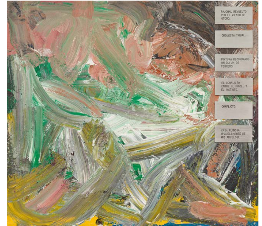
Luis Camnitzer, Pintura con titulos , 1973, aluminum and acrylic on canvas, 36h x 40w in (91.44h x 101.6w cm)