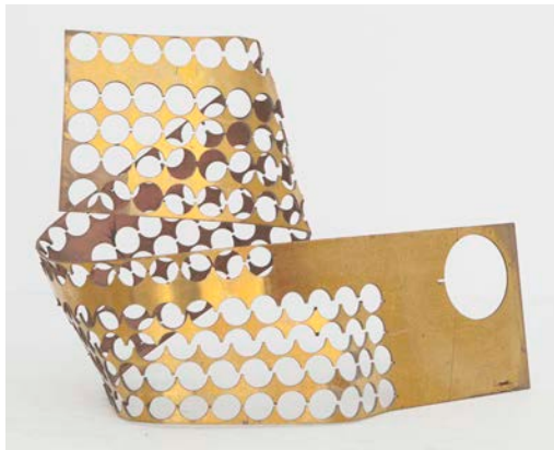
Hassan Sharif, Car Parking , 2015, copper, 17.32h x 21.26w x 12.6d in (43.99h x 54w x 32d cm)