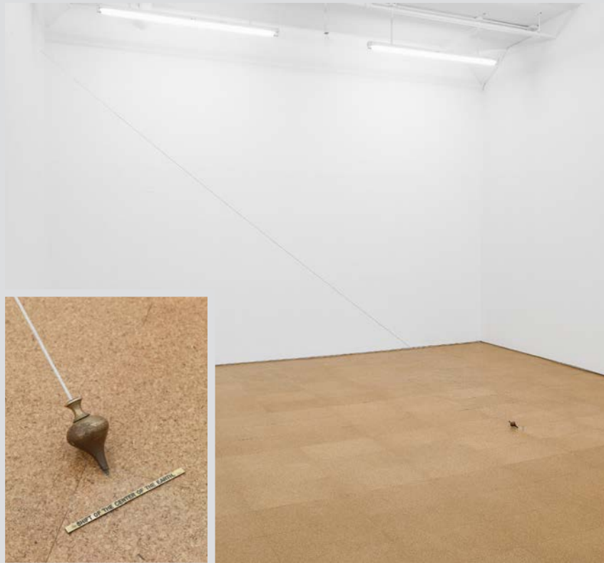
Luis Camnitzer, The Shift of the Center of the Earth , 1975, mason's plumb and brass plaque, dimensions variable