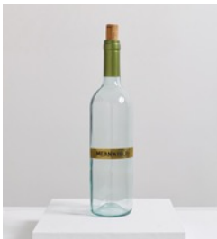
Meanwhile , 2014 Glass, brass plaque, cork, and aluminum 15.6h x 3w x 3d in

This work refers to “Gödel’s ontological proof,” a formal argument by the mathematician Kurt Gödel (1906–1978) for God’s existence. Camnitzer has copied the equation onto a notebook page, which he then crumpled, and displays on the ground. The page appears as if someone has confirmed the existence of a higher power and then discarded the evidence as unimportant trash. The artist undermines the relevance of religion in society by highlighting the futility of proving an issue of faith through science; the study of which is often at odds with religious belief. Camnitzer, notes that his religious identity is “only an ethical component, a bond with my [Jewish] grandparents who were gassed with the famous six million, all of whom I feel died so that I may live.” Thus, his own experiences provide him insight into the role religious differences play in inciting conflict, suggesting an alternative reason for rejecting Gödel’s proof of the existence of God.