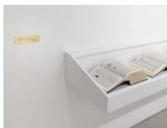
Bereaved Bird Bit Bloody-faced Bohemian , 2017 Mixed media Dimensions variable

"Improbabilities," are a series of dice assemblages contained in artist-made frames. Each Improbability is comprised of 100 dice organized into a perfect square. Using the dotted surface of the dice, Camnitzer creates five distinct patterns that rely on numerical repetition. The artist brings together objects which would traditionally be rolled to achieve an arbitrary outcome and implements visual order in place of potential randomness. His use of dice is representative of his ongoing interest in both literal gameplay as well as the way in which he views art and life: as a game in and of itself.