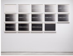
Timelanguage , 2016 Xerox toner on laid paper in 14 parts 18.75h x 12.25w in each Edition of 12 + 1 AP (Ed. 8/12)