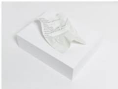
Gödel's Proof of the Existence of God , 2013 Pen on paper 10.75h x 8w x 2.5d in

Timelanguage is a portfolio of 14 Xerox prints, which spell-out the made-up word “Timelanguage,” beginning on the first sheet with only the letter “T.” Each consecutive print reveals one more letter until the full word is rendered. Printed on a gradient from a light gray to black so that the first print is the lightest, and the last is the most pigmented, the sequence uses these visual markers of accumulation and addition to signify the passage of time and information. These works emerge from Camnitzer’s longstanding commitment to expanding the possibilities of printmaking, and embody his ability to use language as a primary medium, both defining characteristics of his practice. This suite was produced by Atelier für Druckgraphik Hamburg.