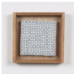
Improbability 4-5 , 2017 Mixed media 9h x 9w x 1.5d in