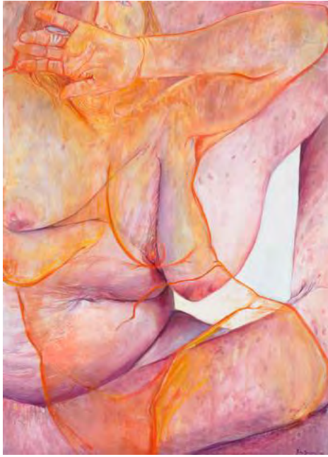
"Open Hand" by Joan Semmel, 2015. Oil on canvas, 66 x 48 inches.

In many ways, that description is too full of self-pity for the intimate and vibrant paintings of Joan Semmel. Just outside Alexander Gray Associates where they hang, the staircase to the High Line offered the constant ascent and descent of women young and old, caught briefly in the dappled sunlight and framed by the massive gallery windows, Marcel Duchamp ( https://www.artsy.net/artist/marcel-duchamp )'s landmark painting set in motion. Like the doubled images of Semmel's dynamic self-portraits, the spectacle was a reminder of beauty that passed, is passing, and still to come.