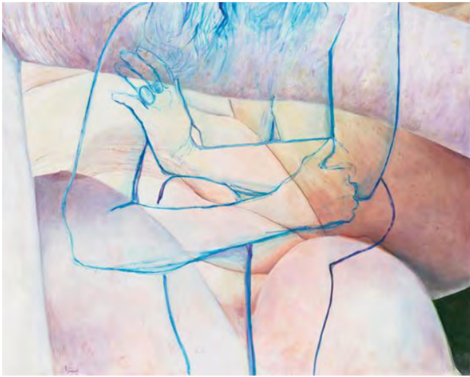
"Blue Embrace" by Joan Semmel, 2016. Oil on canvas, 60 x 48 inches.