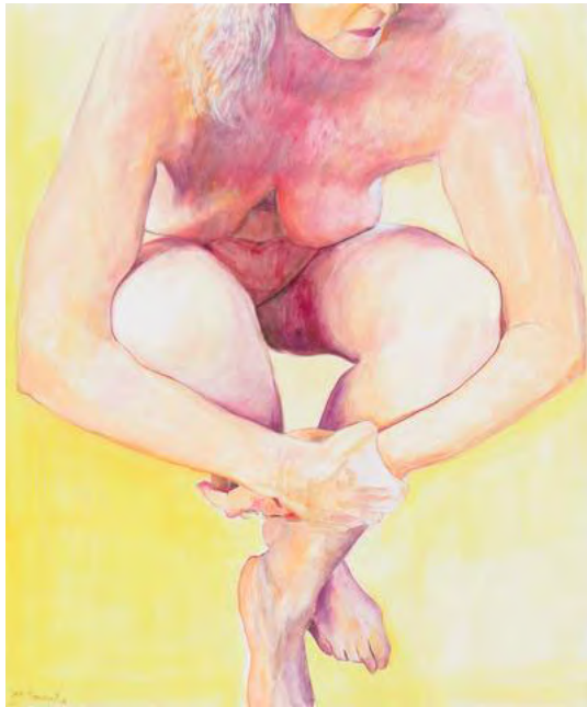
"Embrace" by Joan Semmel, 2016. Oil on canvas, 72 x 60 inches.

Yet even this degree of technical and emotional depth does not reveal the layers of drama to come on the upper level of the gallery, where most of the exhibition unfolds in colossal splendor.