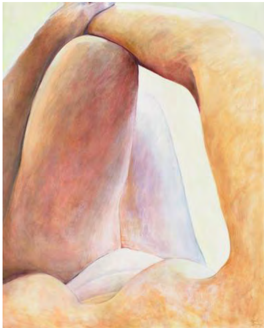
"Cool Light" by Joan Semmel, 2016. Oil on canvas, 60 x 48 inches.

Semmel does not try to defy or hide the effects of gravity or the creeping metamorphoses of a body in its 80s. When wrinkles and blemishes take on this level of heroic significance, as in the plunging folds of the abdomen on the lower left section of Open Hand , we enter the fleshly territory of those candid celebrants of skin and senescence, Rembrandt and Lucian Freud.