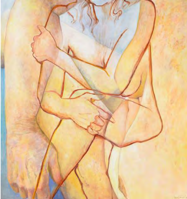
"Double Embrace" by Joan Semmel, 2016. Oil on canvas, 72 x 68 inches.

In the late '70s, Semmel became infuriated with the exploitation of women in pornography and her career took a brisk turn, essential to recognize in order to understand the current exhibition. She shifted to paintings only of the female body, usually solo although the dialectical dance of two figures in the earlier erotic works is continued in one of the most intriguing conceptual devices in the current show, the layering of an open-outline figure across fully rendered figures, sometimes at the same scale, sometimes in a different scale, as in Double Embrace .