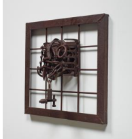
Melvin Edwards Beyond Cabo Verde , 2006 Welded steel 19.75h x 19.75w x 6.75d in

Since his first trip in 1970 to Ghana, Togo, Dahomey (now the Republic of Benin), and Nigeria, Melvin Edwards has consistently traveled to Africa. He eventually established a studio in Dakar, Senegal in 2000. While working in his Dakar studio, Edwards has continued to incorporate everyday materials he encounters. The rakes in Beyond Cabo Verde are ubiquitous in Dakar and used to combat the dust that accumulates in the city. During his time in Dakar, Edwards began mounting his sculptures onto iron grid structures like the one seen in this work, which can be found throughout the city. These grids are crafted by local metalworkers as window bars, a functional purpose that the artist feels is as important to the work as the aesthetic value. Edwards has only made works of this composition in his Senegalese studio, allowing him to collaborate with local craftspeople. The work's title refers to the island nation of Cabo Verde, located off the African continent. Positioned along the routes to and from Africa, Europe, and the Americas, it was a prosperous center of the slave trade. Throughout his body of work, materials, titles, and references unfold multiple meanings as they relate to Africa, the wider Diaspora, and Edwards' own experience.