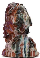
Norbert Prangenberg Kopf , 2012 Glazed ceramic 9h x 5w x 12d in

In J1 , Amy Bessone considers the female form as a vessel and venerated object. Bessone’s truncated female figure, cropped at the neck and thigh, is reminiscent of the classical female nude both in form and color. Bessone applies broad strokes of black paint to the pure white surface to outline and highlight the anatomical features of the female nude under the male gaze; the small of the back, the cinching of the waistline. The sculpture itself is hollow, recalling both the idea of the female body as a vessel for life, but also the female body as a facade or an arbitrary construct. The fetishization of women’s bodies, more specifically individual parts of women’s bodies, is an integral component of Bessone’s practice.