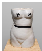
Amy Bessone J1 , 2014 Ceramic and oil paint 25.5h x 18w x 15d in

In Number 177 , Leonardo Drew employs paint and small pieces of wood to create a totemic sculpture with irregular edges. Drew regularly uses cotton, rope, charred wood, and industrial waste materials to construct pieces that display themes of decay, rebirth, and evolution. His work is tied to the history of assemblage practiced by a number of black artists and activists in Los Angeles in the 1950s and 60s, which curator Naima Keith explains as a strategy “to aesthetically redress conflict and destruction through artistic forms that bring together fragments from the communities around [the artists].” For Drew, his interest in weathered looking materials is tied to his upbringing near the landfill in Bridgeport, CT, though importantly he buys all new materials, and subjects them to aging processes in his studio before assembling them. As the critic Michael O’Sullivan commented on Drew’s solo-exhibition in the Hirshhorn Museum and Sculpture Garden in 2000, “on the one hand, his trash can be viewed as a profoundly sad commentary on wastefulness, poverty, classism and decay, while on the other hand, it also comes across as a joyful celebration of life’s textures.”