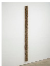
Leonardo Drew Number 177 , 2015 Wood, paint 100h x 6.5w x 5d in

In Number 177 , Leonardo Drew employs paint and small pieces of wood to create a totemic sculpture with irregular edges. Drew regularly uses cotton, rope, charred wood, and industrial waste materials to construct pieces that display themes of decay, rebirth, and evolution. His work is tied to the history of assemblage practiced by a number of black artists and activists in Los Angeles in the 1950s and 60s, which curator Naima Keith explains as a strategy “to aesthetically redress conflict and destruction through artistic forms that bring together fragments from the communities around [the artists].” For Drew, his interest in weathered looking materials is tied to his upbringing near the landfill in Bridgeport, CT, though importantly he buys all new materials, and subjects them to aging processes in his studio before assembling them. As the critic Michael O’Sullivan commented on Drew’s solo-exhibition in the Hirshhorn Museum and Sculpture Garden in 2000, “on the one hand, his trash can be viewed as a profoundly sad commentary on wastefulness, poverty, classism and decay, while on the other hand, it also comes across as a joyful celebration of life’s textures.”