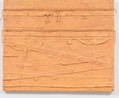
Harmony Hammond Fraggle , 2014 Oil and mixed media on canvas 48.5h x 58.5w in