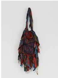
Harmony Hammond Bag X , 1971 Cloth And Acrylic 47h x 18w in

Fraggle belongs to what Harmony Hammond calls her “near monochrome” paintings, which simultaneously engage with and challenge the narrative of modernist painting. Near monochrome, Hammond insists, invites content and positions the painting as a site of negotiation between what exists inside and outside the picture plane. She often describes the painted canvases as skins, and her color choices in Fraggle reference the human body. In this context, Hammond explains, “the grommets are wrapped around the painting as objects and body (suggesting bandage, bondage, binding) but do not cinch or constrict. The straps do not hold the painting together; the paint (and therefore the act of painting) does.” Hammond creates her paintings from the center outwards, building the surface slowly and organically through layers of paint. She incorporates the hand-made straps into this process by placing them on the canvas and painting over them. The grommets, Hammond explains, “Literally open up the painting surface, alluding to layers or space below.” They also reference bodily orifices, functionality, and the possibility of tying down or connecting. Hammond’s use of these materials, uneven layering of paint, and physical manipulation of the work by scraping and incising results in “fugitive” color and surface that are fluid, destabilized, and difficult to locate.