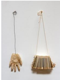
Ann Hamilton near-away , 2013 Mixed media 19.75h x 24.75w x 3d in Edition 8 of 26