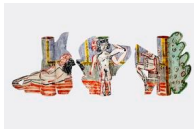
Betty Woodman Kamin Posing , 2009 Glazed earthenware, epoxy resin, lacquer, acrylic paint 35.5h x 98.5w x 7.5d in

Howardena Pindell uses unstretched canvas, paint, and hole-punched paper scraps to create textured, skin-like surfaces. In her 1970s works, Untitled in particular, she demonstrates an interest in experimentation with rough and uneven painted surfaces. Pindell's painting practice centers around a dichotomy of destruction and reconstruction, involving painting or drawing on paper, hole punching the paper, affixing the traditionally discarded paper dots to the canvas, and then using the hole-punched paper as a stencil through which to pour paint. The hole punch has become a hallmark of Pindell's work over the last four decades. As she explained in a 1985 interview, the hole punch allowed her to utilize "very small points of color and light." As her process evolved even further, she began adding sensory elements to her paintings including perfume, an explicit reference to the body and female identity.