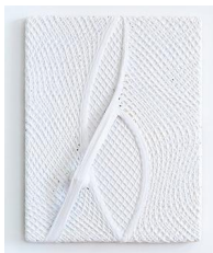
Alexandre da Cunha Net I , 2014 Vest, golf ball and acrylic on canvas 18h x 14w x 3d in

Betty Woodman's ceramics demonstrate an intermingling of fine arts and the domestic sphere. Kamin Posing is a functional set of oversized vases with winged-panels that contain both representational scenes on the front and abstract designs on the reverse, a synthesis of fine art, the decorative, and the domestic. Woodman stated in 2010, "the centrality of the vase in my work is certainly a reference to a global perspective on art history and production. The container is a universal symbol—it holds and pours all fluids, stores foods, and contains everything from our final remains to flowers. The vase motif connects what I do to all aspects of art." Woodman began making ceramics in high school but eventually felt limited by the label of artisan, striving to make works in a fine art context that fused traditional decorative techniques with commentary on the domestic sphere.