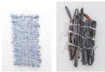
Hassan Sharif (left to right)

For over 50 years, Sheila Hicks has expanded the boundaries of the woven form to create a body of work that defies traditional categorization into the fields of fine art, craft, design, and architecture. Her education at Yale under Josef Albers as well as her time spent in South America in the late 1950s influenced her interest in color and textile vocabulary as an artistic medium. Advancing, Beginning to End and La Foret Bleue I are part of the minimes series consisting of intimately scaled hand-woven works created continuously over the entirety of Hicks' career. The minimes often reference her engagement with multiple cultures both in their titles and in the materials she utilizes. Hicks is also committed to the integrity of her chosen materials stating, "If it was granite, it had its own laws, and if it was fiber it had its own laws." In Advancing, Beginning to End , Hicks highlights the tactile quality of the medium and emphasizes the hand of the artist through the varying tensions of the woven rows. In La Foret Bleue I , she juxtaposes the textile's folds with the frayed edge protruding outward in the lower lefthand corner, defying the fabric's inherent flatness. For her, these fiber works made from "supple materials," invoke the tactile quality of the medium and occupy a space between painting, drawing, and sculpture.