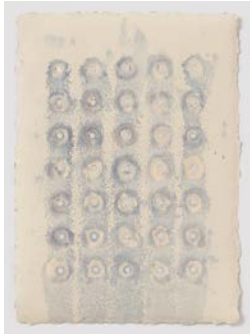
White Rims #1 , 2015 Monotype on paper with metal grommets 47h x 33.5w in.

510 West 26 Street New York NY 10001 United States Tel: +1 212 399 2636 www.alexandergray.com