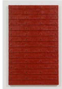
Red Stack, 2015 Oil and mixed media on canvas 80.25h x 50.5w 5d in.