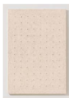
Trace, 2015 Oil and mixed media on canvas 80.25h x 54.5w 5d in.

Hammond's recent paintings exemplify her long history of experimentation with materials and process, and inhabit a space between painting and sculpture. These works have a relationship with her early feminist practice in the way she integrates materials, such as metal grommets, cloth and rope into the painting field. For Hammond, "underlying this practice was the belief that materials (in my case cloth) and the ways they are manipulated (layering, piecing, weaving, stitching, knotting, ripping, wrapping, patching, braiding, lacing, etc.) contribute to content as much as form, sign or symbol." Ultimately, both the physicality of her painting process and the surfaces she achieves evoke the body's skin.