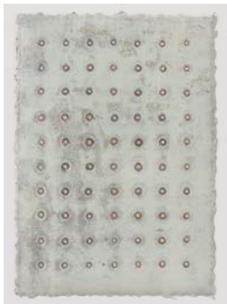
White Rims #4 , 2015 Monotype on paper with metal grommets 47h x 33.5w in.