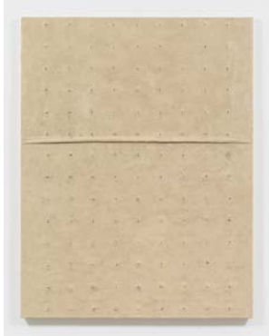
Witness , 2014 Oil and mixed media on canvas 90.25h x 70.5w x 5d in.