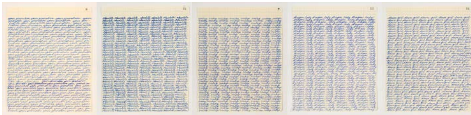
Ledger Drawings Suite A , 2015, ink on paper in 5 parts, 11.75h x 9.5w in. each part

In her recent paintings, Hammond grommets a field or grid of holes into her canvases. Layering patches of fabric, straps and grommets intermittently with oil paint, she builds textured near-monochromatic surfaces of earthy reds, deep-blacks, dusty beiges, and creamy whites, activated by light and cast shadow. The gridded field of grommets physically opens the painting surface alluding to layers, spaces and histories buried below as well as body orifices. A close examination of what at first glance might appear to be minimal monochrome grid paintings, reveals a disturbance or rupture as underlying layers of color are visible through cracks, crevices and holes, interrupting both surface and grid. For Hammond, “It’s about what’s hidden, muffled, covered up or over, pushing up from underneath, asserting itself, suggesting agency and voice.” In Bandaged Grid #1 , she applies fraying strips of leftover canvas to evoke a bandaged body.