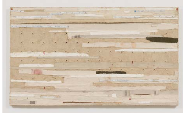
Bandaged Grid #1 , 2015 Oil and mixed media on canvas 44.25h x 76.5w x 5d in.

In her recent paintings, Hammond grommets a field or grid of holes into her canvases. Layering patches of fabric, straps and grommets intermittently with oil paint, she builds textured near-monochromatic surfaces of earthy reds, deep-blacks, dusty beiges, and creamy whites, activated by light and cast shadow. The gridded field of grommets physically opens the painting surface alluding to layers, spaces and histories buried below as well as body orifices. A close examination of what at first glance might appear to be minimal monochrome grid paintings, reveals a disturbance or rupture as underlying layers of color are visible through cracks, crevices and holes, interrupting both surface and grid. For Hammond, “It’s about what’s hidden, muffled, covered up or over, pushing up from underneath, asserting itself, suggesting agency and voice.” In Bandaged Grid #1 , she applies fraying strips of leftover canvas to evoke a bandaged body.