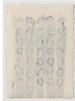
White Rims #2 , 2015 Monotype on paper with metal grommets 47h x 33.5w in.