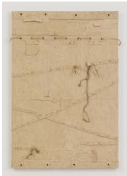
Things Various, 2015 Oil and mixed media on canvas 80.25h x 54.25w x 5d in.