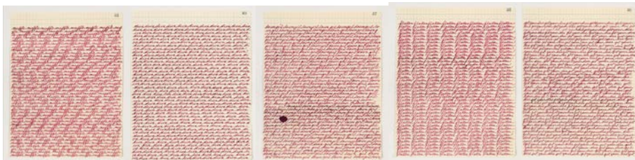
Ledger Drawings Suite B , 2015, ink on paper in 5 parts, 11.75h x 9.5w in. each part

“At night, I make text drawings on pages from a ledger book. I reinscribe words and phrases used to refer to and put down women artists of my age and older, over and over in red, blue and brown inks, as if to interrogate their intended meaning and render them powerless. In doing so, I claim those words on my own terms.” — Harmony Hammond