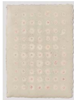
White Rims #7 , 2015 Monotype on paper with metal grommets 47h x 33.5w in.