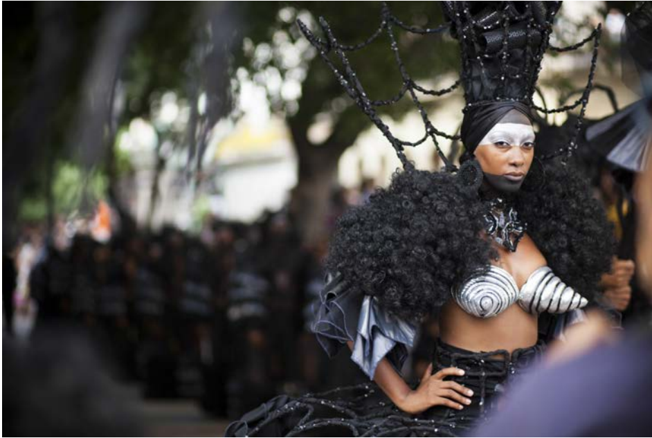
Los Carpinteros, Conga Irreversible 2012

In Cuba, these distinctions have a very strong political effect. Art that is determined to be a form of protest against the state can easily be stripped of its status as art and treated as a criminal offense. That also happens occasionally in the US but much less often.