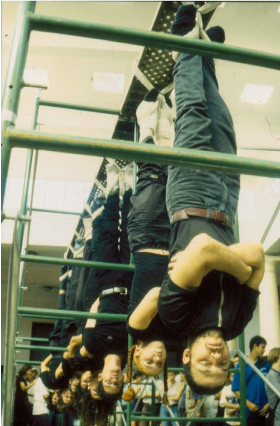
Enema Collective, You See What You Feel 2004

kinds of performance in my book, I focus on the performance artists who have focused their practice on street intervention, political conduct and state power.