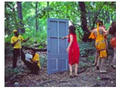
The Woman in Red goes to the Black Male Artists' door and the Debauchees dance back up the hill