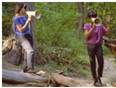
The Art Snobs' chatter continues