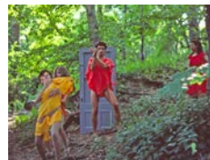
The Debauchees dance down the hill, the Woman in Red falls further behind