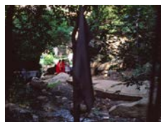
They exit the bridge tunnel at The Loch's end