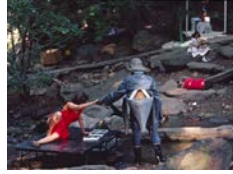
She is absorbed, but the Memorial insists