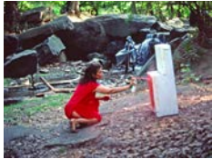
The stove becomes more and more red