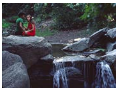
Their flirtation begins