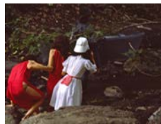
The three enter the stream