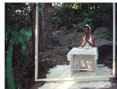
The Woman in White grates coconut in her kitchen, with the fir-palm tree outside