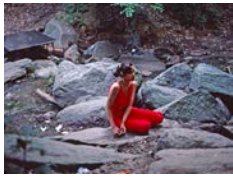
The Teenager in Magenta sits alone with her headphones