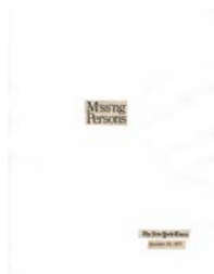
Missing Persons 11.02h x 102.36w inches, in 13 parts