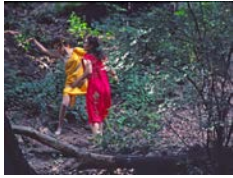
The Woman in Gold rejects the Woman in Red