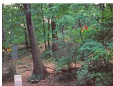
As the Black Artists in Yellow work in their studio, the Debauchees enter at the top of the hill