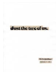
Just the two of us 11h x 86.6w inches, in 8 parts