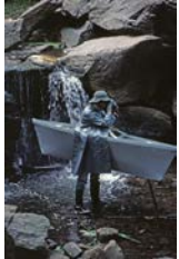
The Nantucket Memorial blends into the granite and the stream