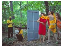
The Woman in Red begins to break away from the Debauchees