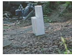
She descends to the stream where the white stove is standing