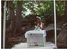
The Woman in White continues grating coconut