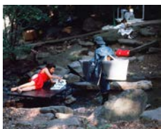
The Woman in Red returns to her album, and the Nantucket Memorial comes to life