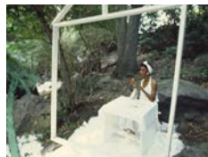
The Woman in the White Kitchen tastes her coconut