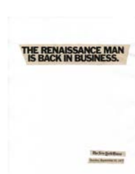
The Renaissance Man is Back in Business 11.02h x 86.61w inches, in 11 parts