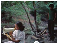
The Young Man in Green enters the scene