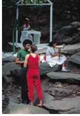
The Young Man in Green rouses the Teenager from depression