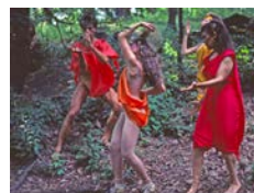
The Debauchees dance in place, and the Woman in Red catches up to them