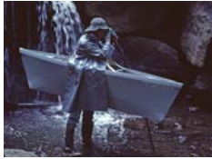
The Nantucket Memorial stands motionlessly in the stream