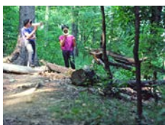
The Art Snobs comment for the last time