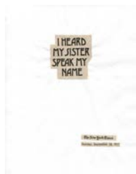
I Heard My Sister Speak My Name 88.19h x 7.87w inches, in 8 parts