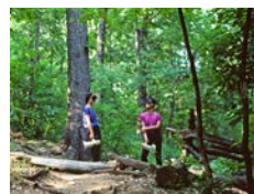
The Art Snobs briefly stop bantering