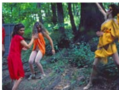
The Debauchees ignore the Woman in Red