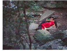
The Young Man in Green makes love to the Teenager in Magenta