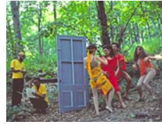
The Debauchees intersect the Woman in Red, and the rape begins