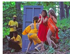
The Artists in Yellow work on their projects as the Woman in Red struggles with the Debauchees