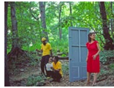
The Woman in Red hesitates outside after the Black Male Artists in Yellow eject her