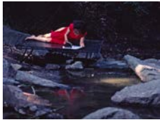
The Woman in Red, on a bed jutting into the water, skims an accordion-folded album of photos