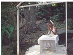
The Woman in White eats coconut as she looks away from the action