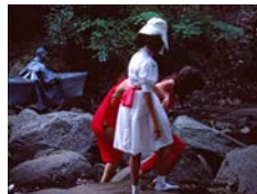
The Woman, the Teenager in Magenta, and the Little Girl in Pink Sash steady each other's footing