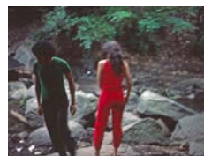
The Young Man pulls away