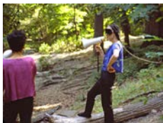
Two Art Snobs dissect who's who and what's what in the art world