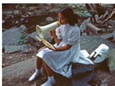
A Little Girl with Pink Sash memorizes her Latin lesson