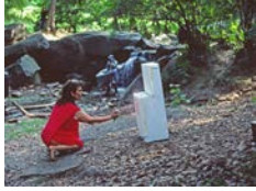
The Woman in Red starts painting the stove her own color