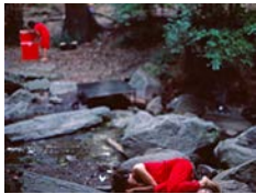
The Woman in Red cooks, and the Teenager in Magenta lies curled across the stream