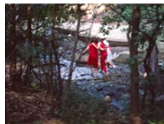
The Woman in Red, the Teenager in Magenta, and the Little Girl in Pink Sash wade the stream