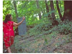
The Woman in Red walks toward the studio of the Black Artists in Yellow