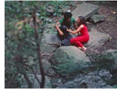
The Young Man prepares to leave, and the Teenager tries to hold on to him