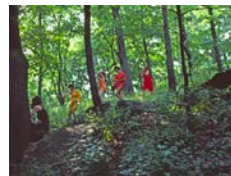
The Debauchees dance to New Wave music with the Woman in Red following