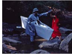
The Nantucket Memorial guides the Woman in Red to the other side of the stream