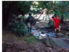
Preceded by the Nantucket Memorial, the three make their way down