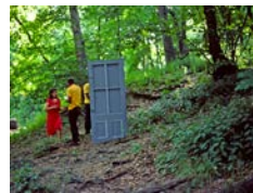
The Woman in Red tries to join the Black Male Artists but is ejected by them