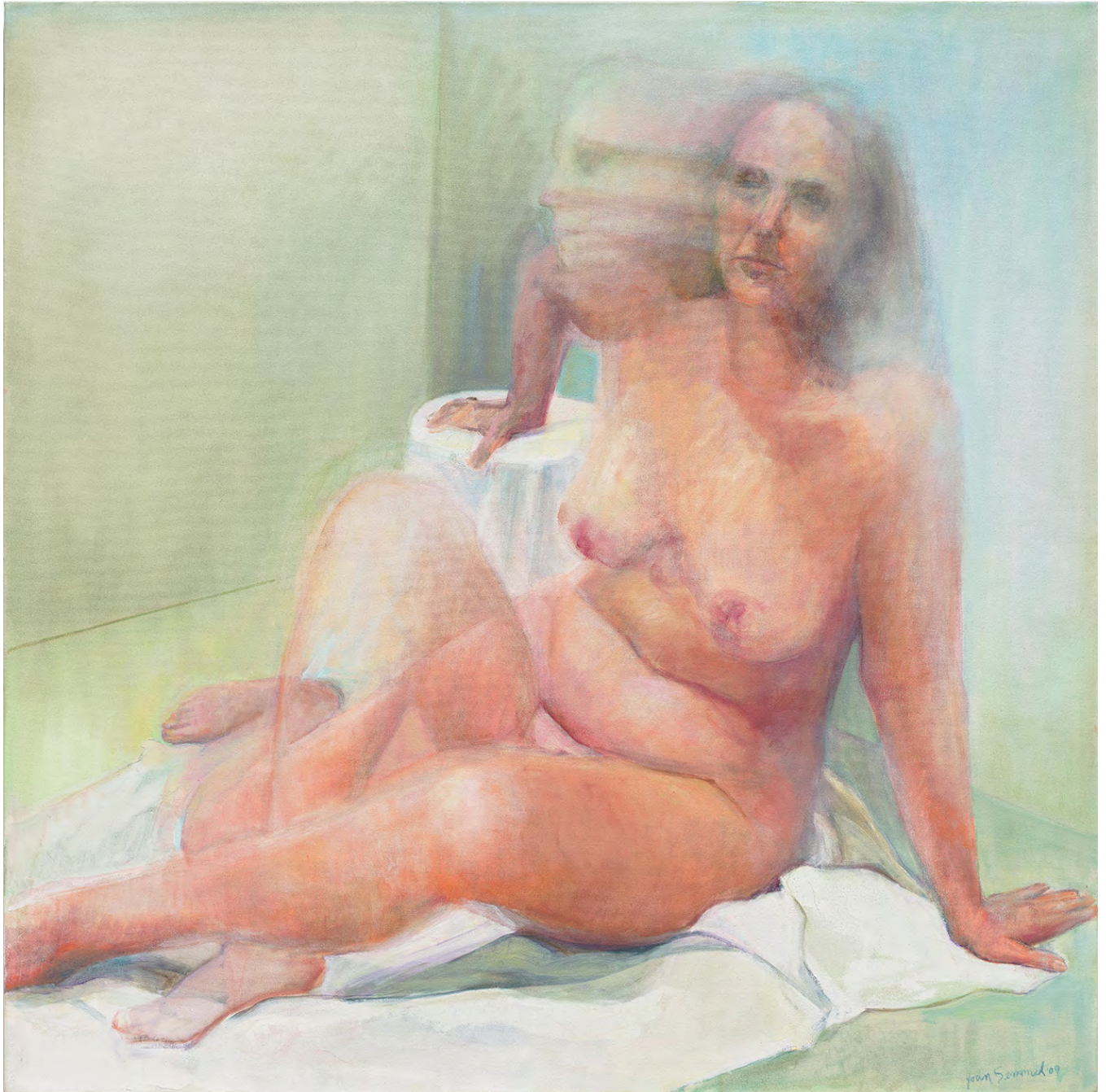
Joan Semmel, "Ghost" (2009)

sense of disappearing — the image is there and suddenly it's not there and then it's really not there. So that it moves. I was interested in that from the point of view of the disappearing of the image, but I was also interested in it from breaking down the objectiveness of the image, of it being static. The image, the body, the woman is not a static object but is somebody that moves in space and time. And then, in the more recent works, I used transparency for the same reasons: to try to get the sense of motion and the question of time and a kind of layering of memory, of how you understand yourself as you are and as you were and as you will be.