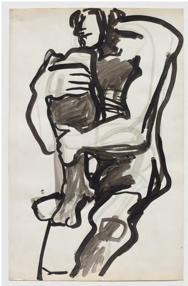
Joan Semmel, “Untitled (figure study)” (c. 1972) (click to enlarge)