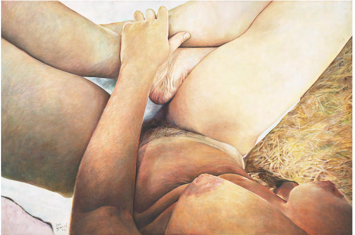
Joan Semmel, "On The Grass" (1978) (courtesy Alexander Gray Associates, New York, © 2015 Joan Semmel / Artists Rights Society [ARS], New York)

just the head, and they are all me but none of them are the same. Just catching myself at lots of different times. And so, even with yourself you are not always the same; you are different from moment to moment because you act and are being acted upon. For me, the mirror was a tool, just like the camera is a tool. It's a way of getting the image, and I couldn't always be looking down at myself, so how could I get the rest of it?