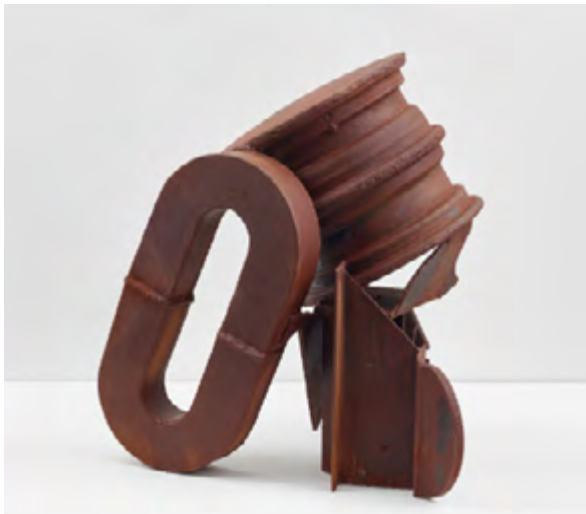
Melvin Edwards, To Cross Water , 1990, welded steel 30h x 28w x 27d in (76.2h x 71.12w x 68.58d cm)