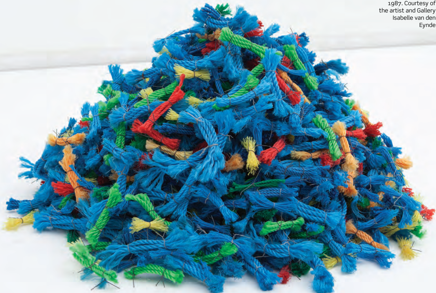
'Plastic and Wire 2', 1987.