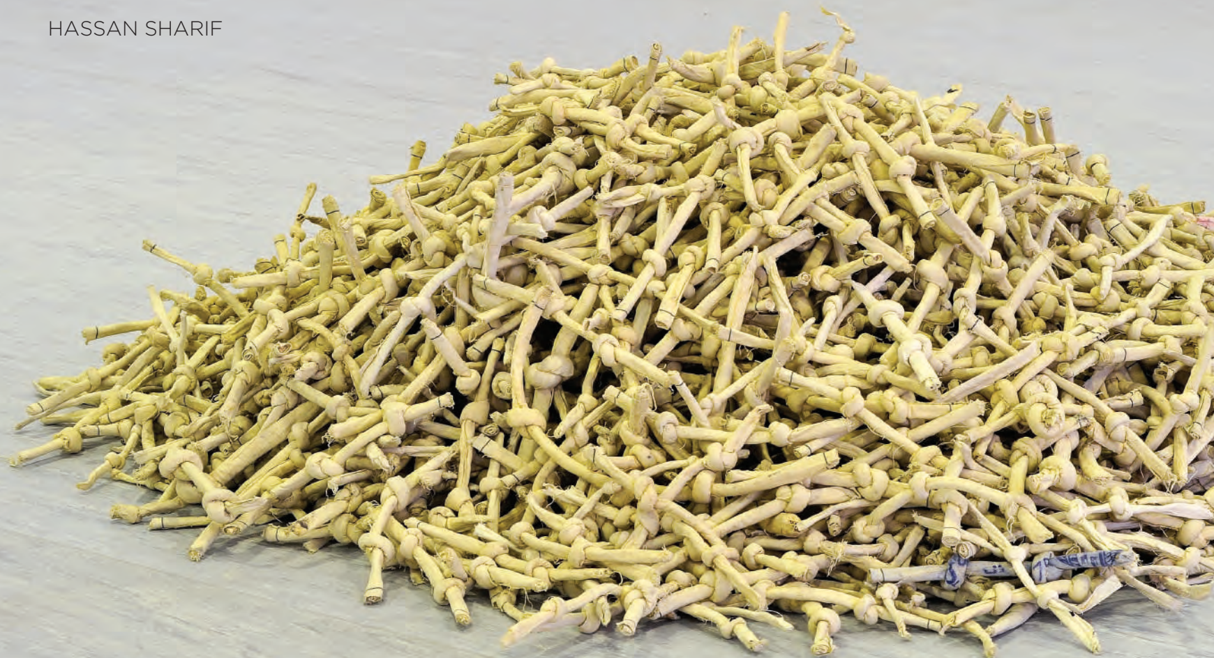
(Right) 'Spoons and Cable', 2006.