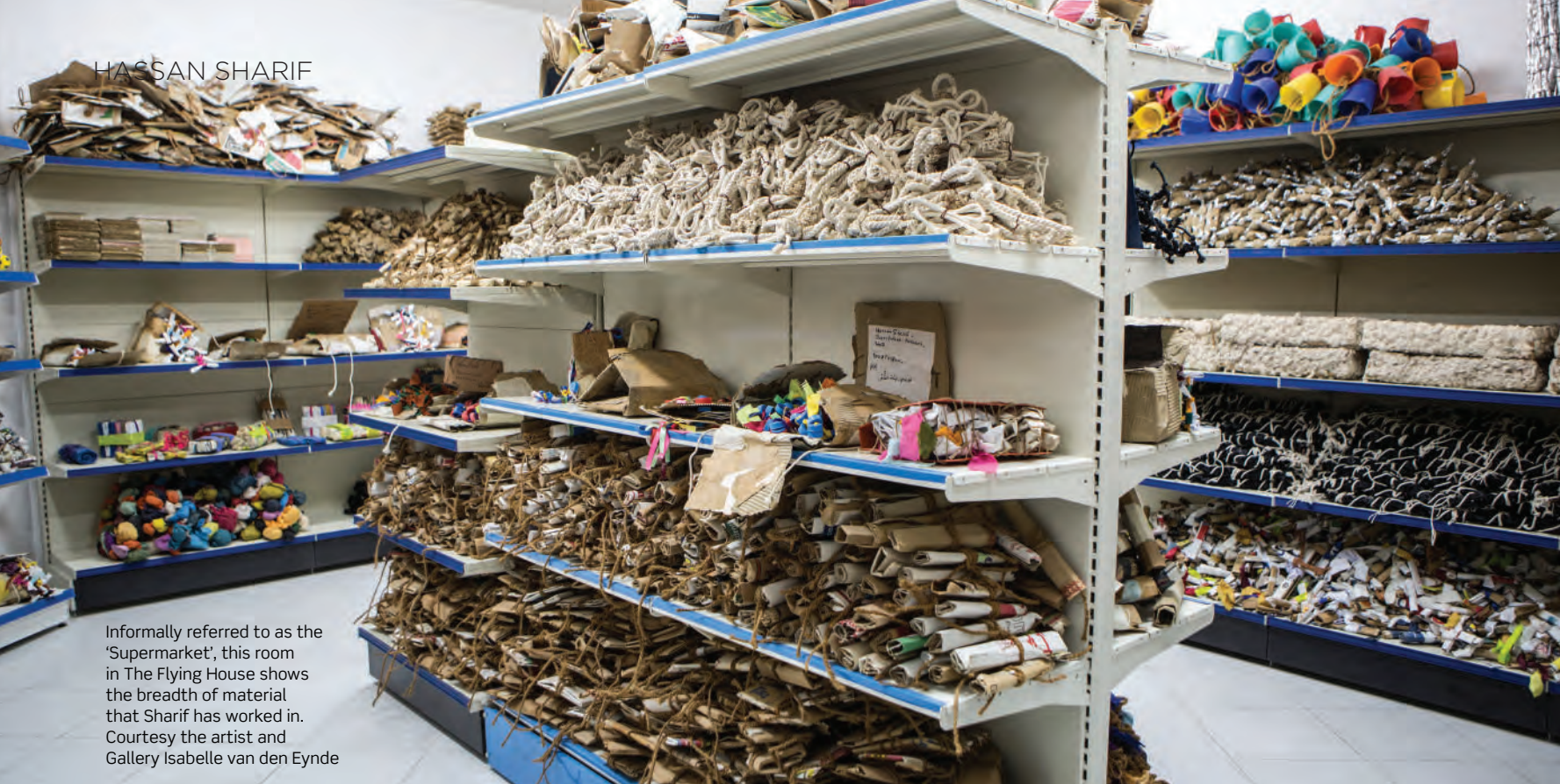
Informally referred to as the 'Supermarket', this room in The Flying House shows the breadth of material that Sharif has worked in.

century has become our terminology. We cannot disregard any past.