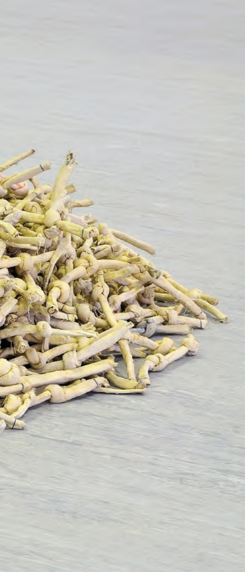
(Left) 'Cloth and Glue', 1987.

HS: When I returned to the UAE in the '80s, I had to be dogmatic in my work and not exhibit my paintings – I still painted, of course, but I didn't exhibit those, nor did I exhibit my Semi-System works because they can be beautiful, be hung on the wall and therefore don't harm the audience. Instead, I just showed my Objects . I insisted that my Objects must be thrown on the floor, and acts like this would stimulate the audience, even make them angry. I wanted that because I was fighting, and objects were my weapon: I sought the audience's rejection. Now I don't mind exhibiting painting, drawings or semi-systems nor do I mind if the curator decides to exhibit my Objects in a certain way - I say, "Ok, go ahead."