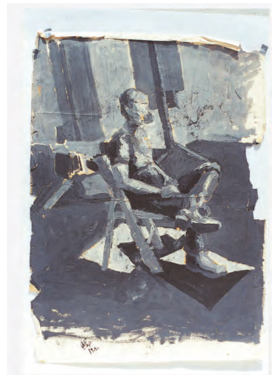
(Right) 'Man', 1980.