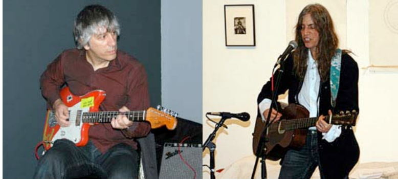
Left: Text of Light's Lee Ranaldo. Right: Patti Smith.