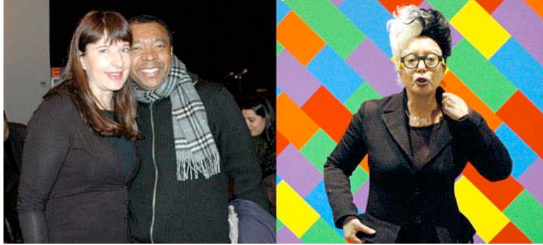
Left: Artist Marina Abramovic with curator Okwui Enwezor. Right: Artist Orlan.

room—into their “straight men”: “Keep Making Trouble,” the masked avengers advised. “Keep finding better ways to do it.”