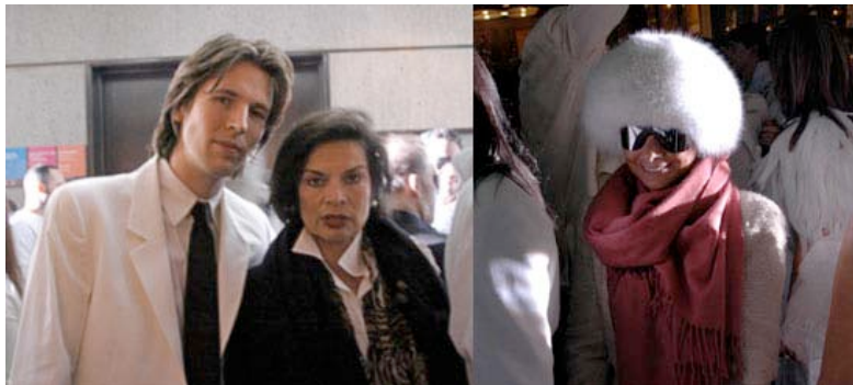
Left: Artist Ryan McGinley with Bianca Jagger. Right: Dealer Mary Boone.