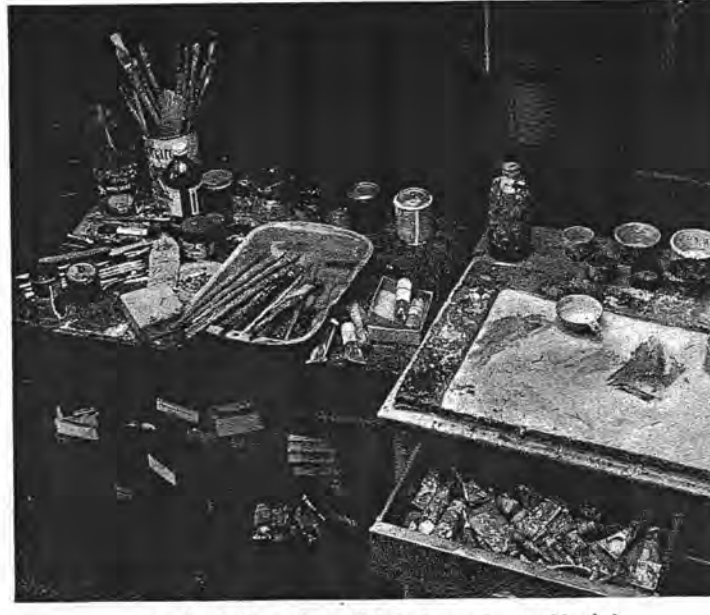
Tworkov's glass palette [right] where colors are blended before being mixed in a cup with varnish and oil.

Though the subject is erotic in a general way, the particular form and the momentary form are mysterious to the artist in