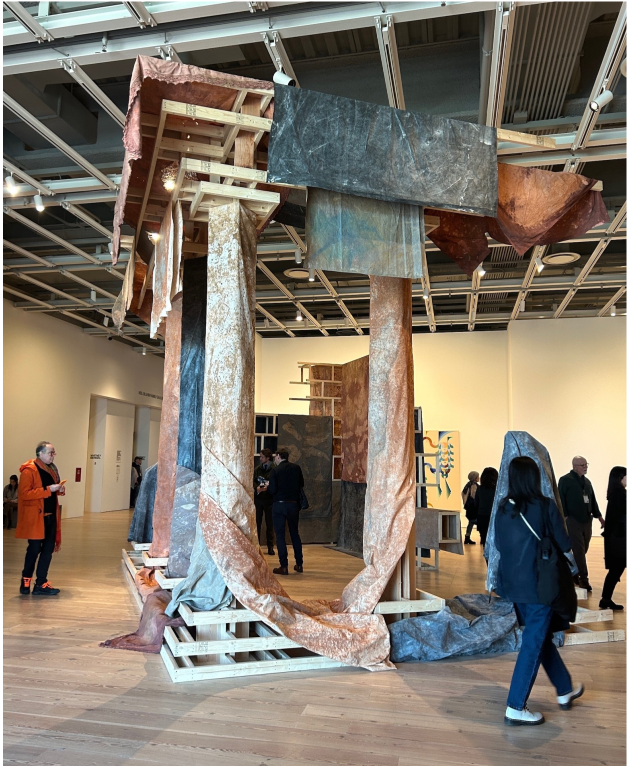
Installation view of the 2024 Whitney Biennial featuring Dala Nasser, "Adonis River" (2023)