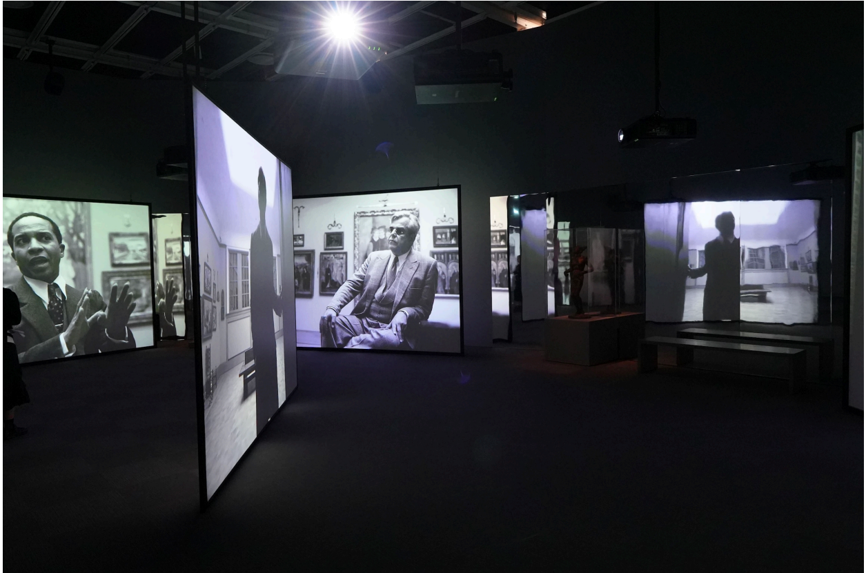
Installation view of Isaac Julien, "Once Again... (Statues Never Die)" (2022) at the 2024 Whitney Biennial