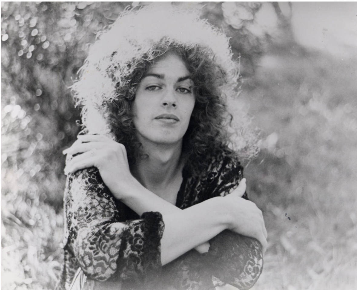
Penelope Spheeris, still from "I Don't Know" (1970), 16mm film, black and white, sound; 20:11 minutes