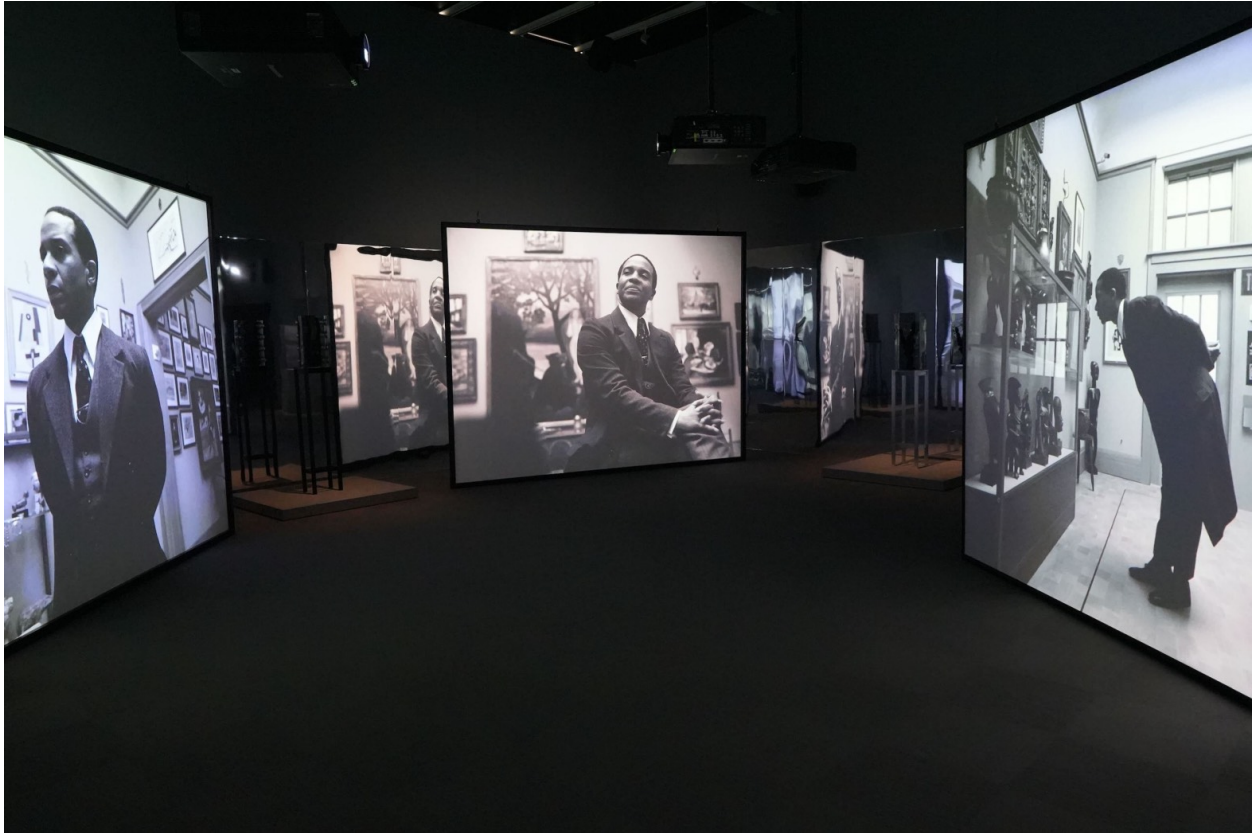
Installation view of Isaac Julien, "Once Again ... (Statues Never Die)" (2022)

This installation, which features multiple screens and five historical and contemporary artworks, encapsulates what the veteran queer British video artist does best: enabling us to linger and examine those moments of interpersonal desire and connection that are often overlooked in a field seemingly obsessed with objects. The videos are the stars of this presentation, as the objects feel obscured and pushed to the edges, perhaps to suggest that they are receding into the shadows to allow the voices of those who placed them there to shine. While the work focuses on the Pitts-River Museum in the United Kingdom and the Barnes Collection in Pennsylvania, the artist decided to use the interiors of the Pennsylvania Fine Arts Academy, as well as other spaces, as a stand-in for the original Barnes mansion-turned-museum. This was one of the best videos in a Biennial with some very strong video work. – HV