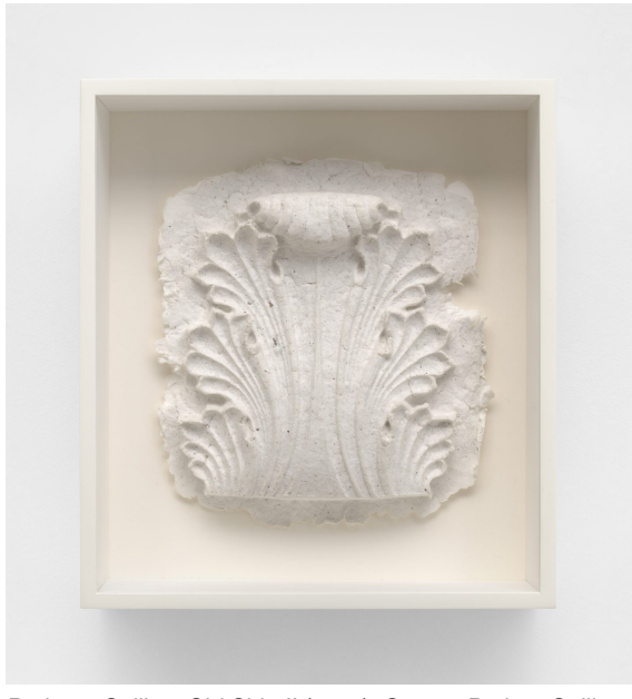
Bethany Collins, Old Ship II (2023). © 2023 Bethan Collins. Courtesy of Alexander Gray Associates, New York; Patron Gallery, Chicago.

The exhibition, on view through December 16, 2023, is her first with the gallery, which she joined late last year. "Undercurrents" traces Collins' interrogation of language, text, and the limits of paper as a medium. The show traverses four key bodies of work, which engage with everything from Ancient Greek literature to the Black Lives Matter protests of 2020.