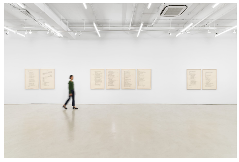
Installation view of "Bethany Collins: Undercurrents" (2023).

"'Antigone' and the 'Lost Friends' are separated by centuries and are very different people and circumstances, but they are both responses to the aftermath of civil war. That kind of chorus of longing, they both become a kind of chorus that collapses time. And I think they're also not just a kind of resistance and ritual, but also indicate a faith in reunification, that what you do still matters, even in that moment."