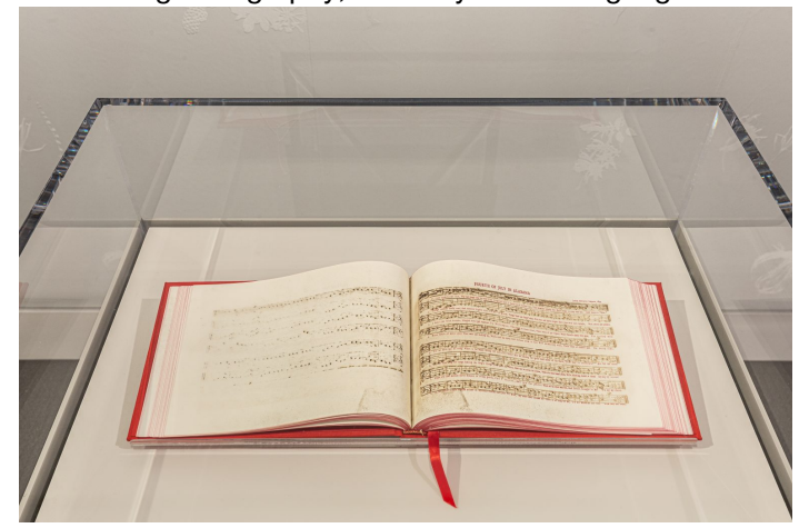
Installation view of "Bethany Collins, America: A Hymnal" (2023).

The Crystal Bridges' exhibition centered on the work America: A Hymnal (2017), an immersive piece that explores 100 versions of the anthem My Country 'Tis of Thee , which underwent rewrites between the 18th and 20th centuries to support various causes. Here, the written versions are bound together chronologically in an artist book. Collins has burned away the sheet music notes with a laser. A sound work, installed in the room, relays six different voices singing all 100 versions at once—a cacophony, but a familiar dissonance, even so. The various melodies and lyrics remain recognizable. America: A Hymnal is currently on view at the Peabody Essex Museum, through 2024, shown in a gallery wallpapered with a new work of flocked flower silhouettes referencing floriography, or the symbolic language of flowers.