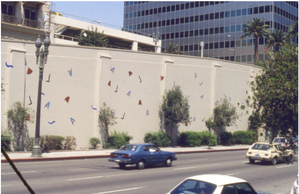
Betye Saar, "L.A. Energy," 1983, 5th Street between Flower Street and Grand Avenue; courtesy of the artist and Roberts Projects Los Angeles, California.