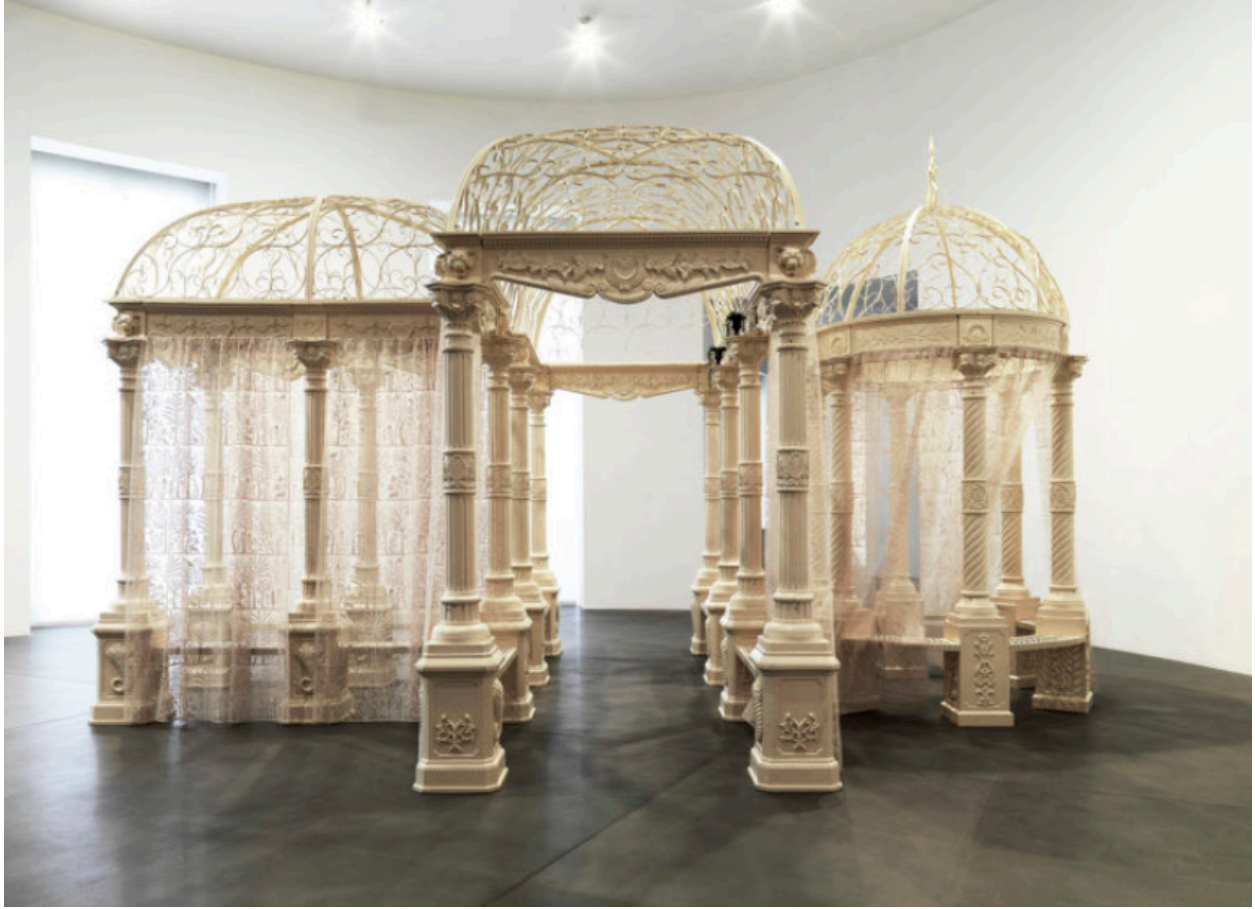
Chris Burden, "Dreamer's Folly," 2010, Cast iron gazebos and lace fabric, 136 x 164 x 223 inches; © 2022 Chris Burden / licensed by The Chris Burden Estate and Artists Rights Society (ARS), New York, courtesy of Gagosian.