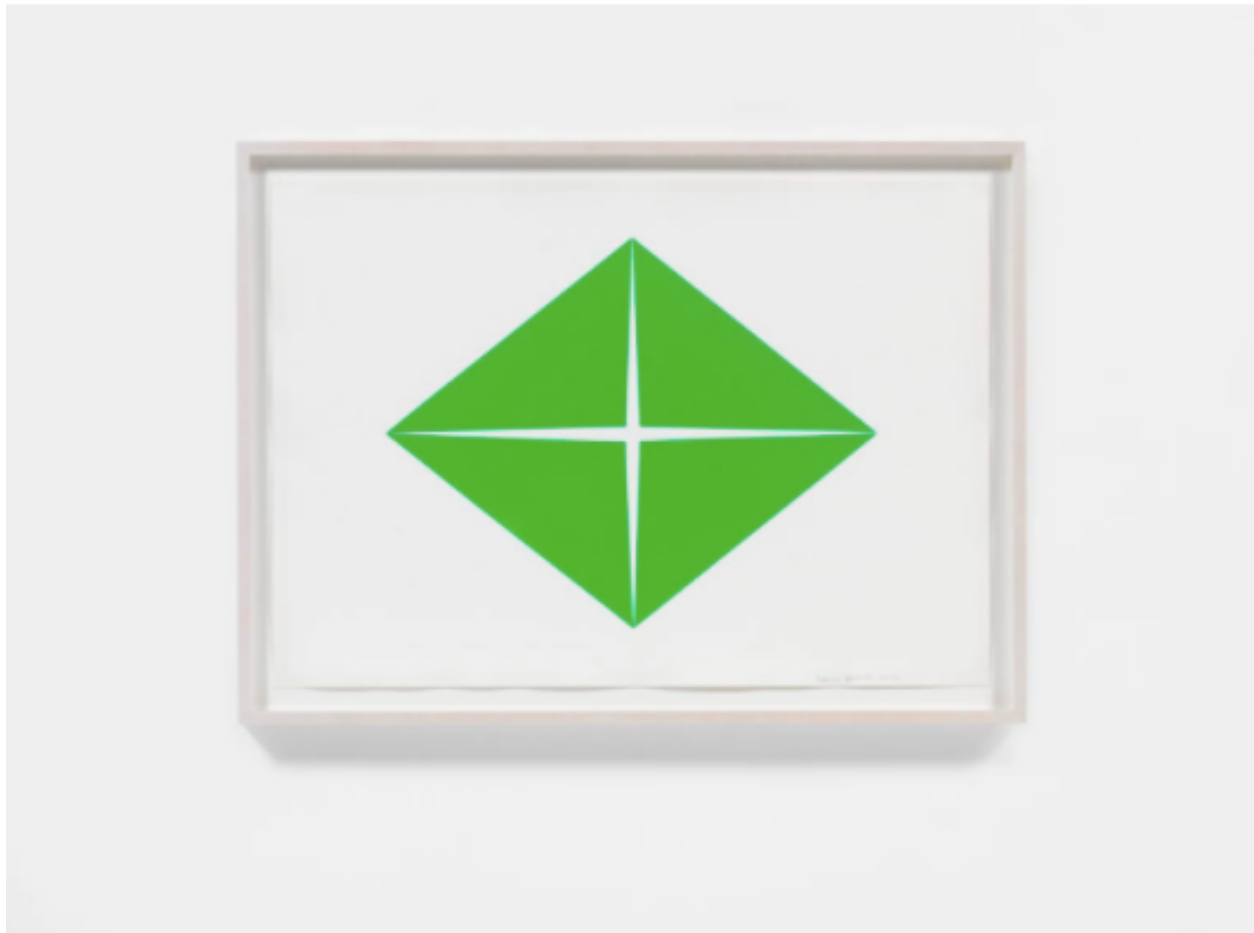
Carmen Herrera, "Untitled," 2012, Acrylic and pencil on paper, 19.7 x 27.6 inches; courtesy of the artist and Lisson Gallery.