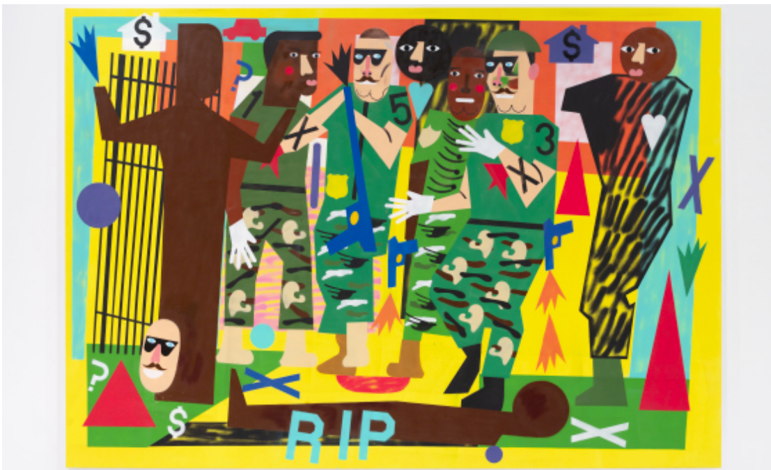
Nina Chanel Abney, "Whatever It Takes," 2018, acrylic and spray paint on canvas, 84 1/2 x 120 1/8 x 1 1/2 inches, Dallas Museum of Art, gift by the Green Family Collection.

The Green Family Art Foundation (GFAF), a Dallas-based nonprofit foundation, has announced on social media that they have acquired a new permanent space in the city's downtown Arts District.