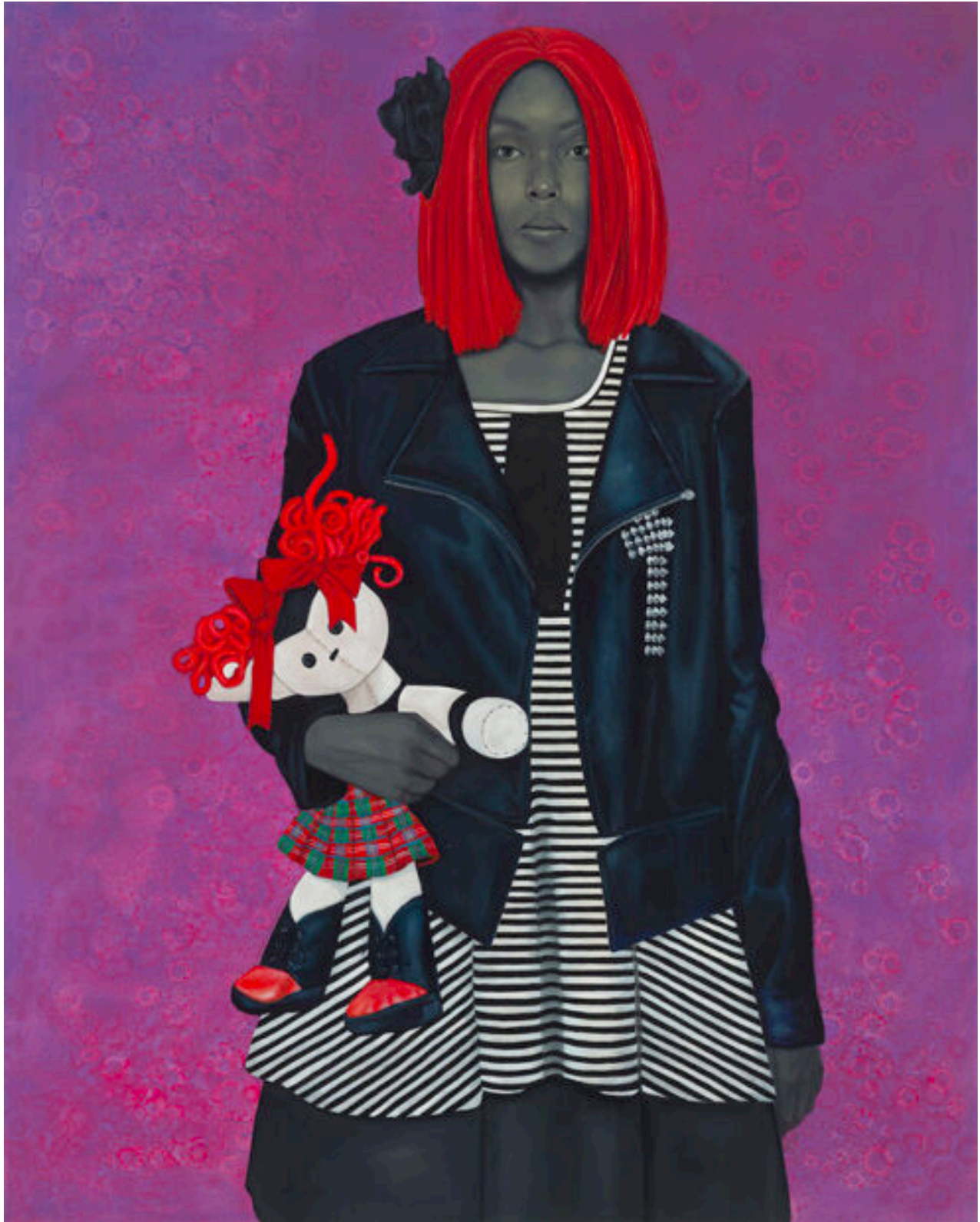
Amy Sherald, "Freeing Herself Was One Thing, Taking Ownership of That Freed Self Was Another," 2015, oil on canvas, 54 x 43 inches.

The final exhibition in the GFAF's current space, Women of Now: Dialogues of Memory, Place & Identity , will be on view from February 12 – May 22, 2022.