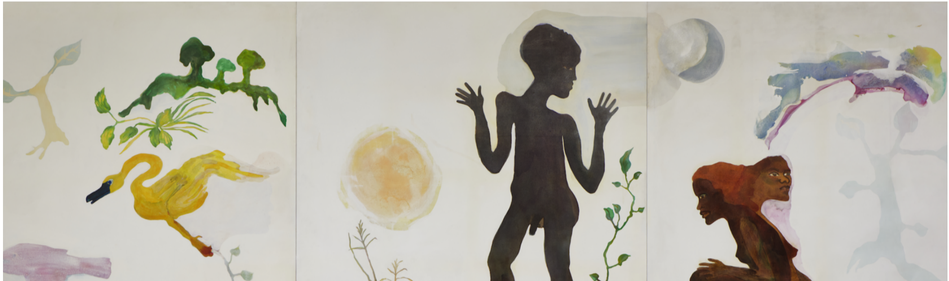
Joan Semmel, Spaced Out, 2019.

Taking place February 17 to 20, 2022, Frieze Los Angeles will feature solo presentations by some of the most influential and thought-provoking artists working today.