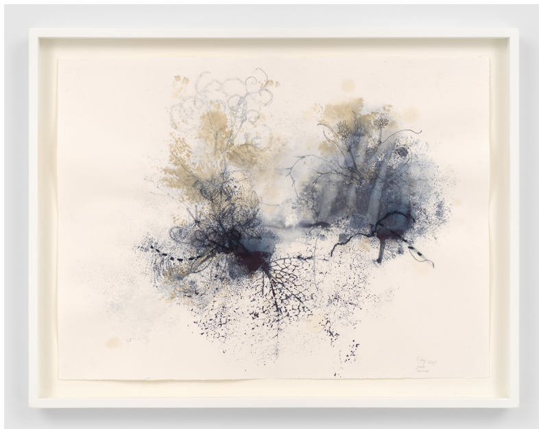
Ricardo Brey, Pasiflora , 2021, Mixed media on paper, 22 1/2 x 30 in (57.1 x 76.2 cm), 26 1/4 x 33 3/4 x 2 in framed (66.7 x 85.7 x 5.1 cm framed), © Ricardo Brey, Courtesy the artist and Alexander Gray Associates