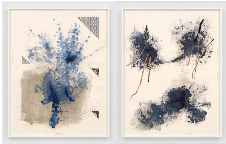
Left: Ricardo Brey, Blue Curse , 2019, Mixed media on paper, 63 x 48 in (160 x 121.9 cm), 67 1/4 x 52 x 2 in framed (170.7 x 132.1 x 5.1 cm framed), © Ricardo Brey, Courtesy the artist and Alexander Gray Associates