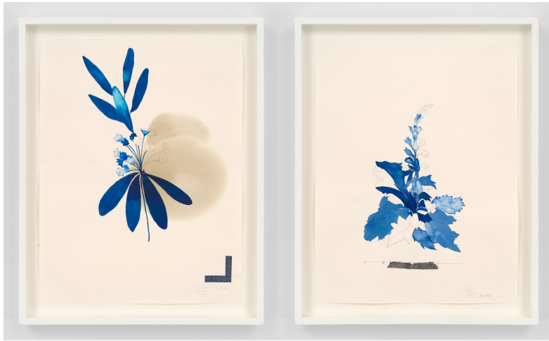
Left: Ricardo Brey, Sheep Laurel, 2021, Mixed media on paper, 26 x 19 3/4 in (66 x 50.2 cm), 29 3/4 x 23 1/2 x 2 in framed (75.6 x 59.7 x 5.1 cm framed), © Ricardo Brey, Courtesy the artist and Alexander Gray Associates