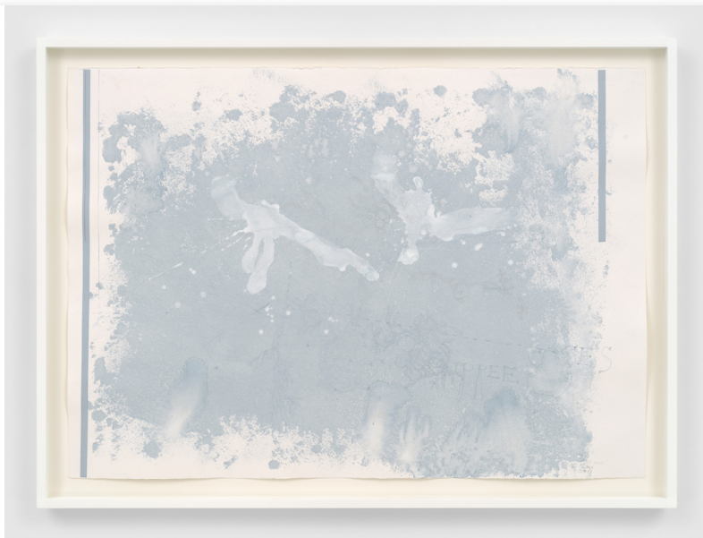
Ricardo Brey, Ciprés, 2021, Mixed media on paper, 27 3/4 x 39 1/4 in (70.5 x 99.7 cm), 31 5/8 x 43 1/8 x 2 in framed (80.3 x 109.5 x 5.1 cm framed)