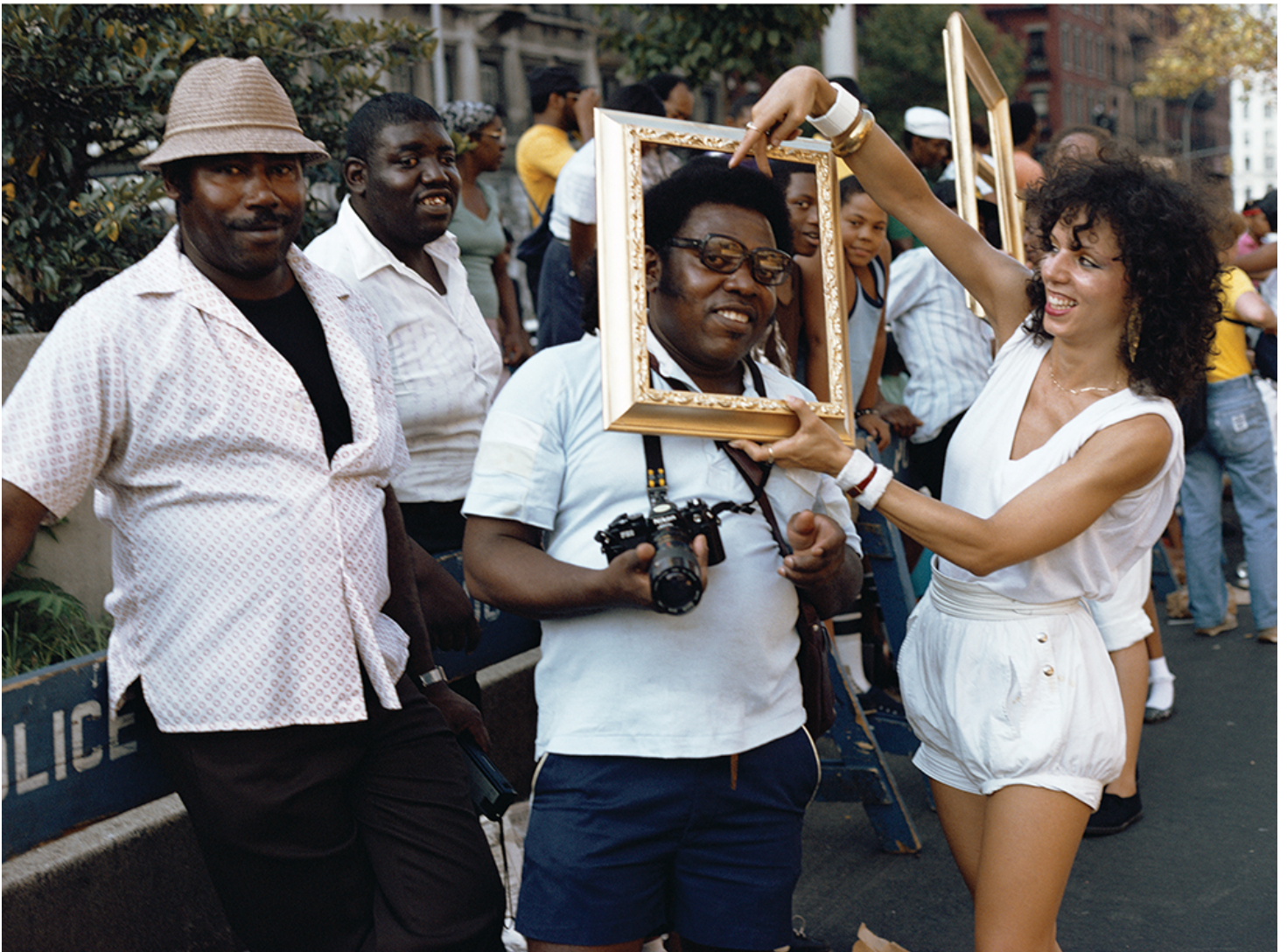
Lorraine O'Grady: Art Is. . . (Man with a Camera) , 1983/2009, C-print, 16 by 20 inches.

COURTESY ALEXANDER GRAY ASSOCIATES, NEW YORK. ©LORRAINE O'GRADY/ARTISTS RIGHTS SOCIETY (ARS), NEW YORK