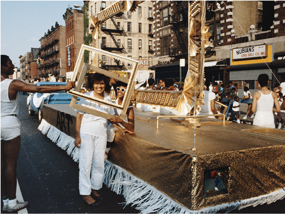
Lorraine O’Grady: Art Is . . . (Nubians) , 1983/2009, C-print, 16 by 20 inches.

any intelligence. O’Grady has had to create the gallery and the art historical audience (if not the audience that quite literally meets her work in the street) capable of understanding the work and meeting it on its own hybrid literary/theoretical/representational grounds.