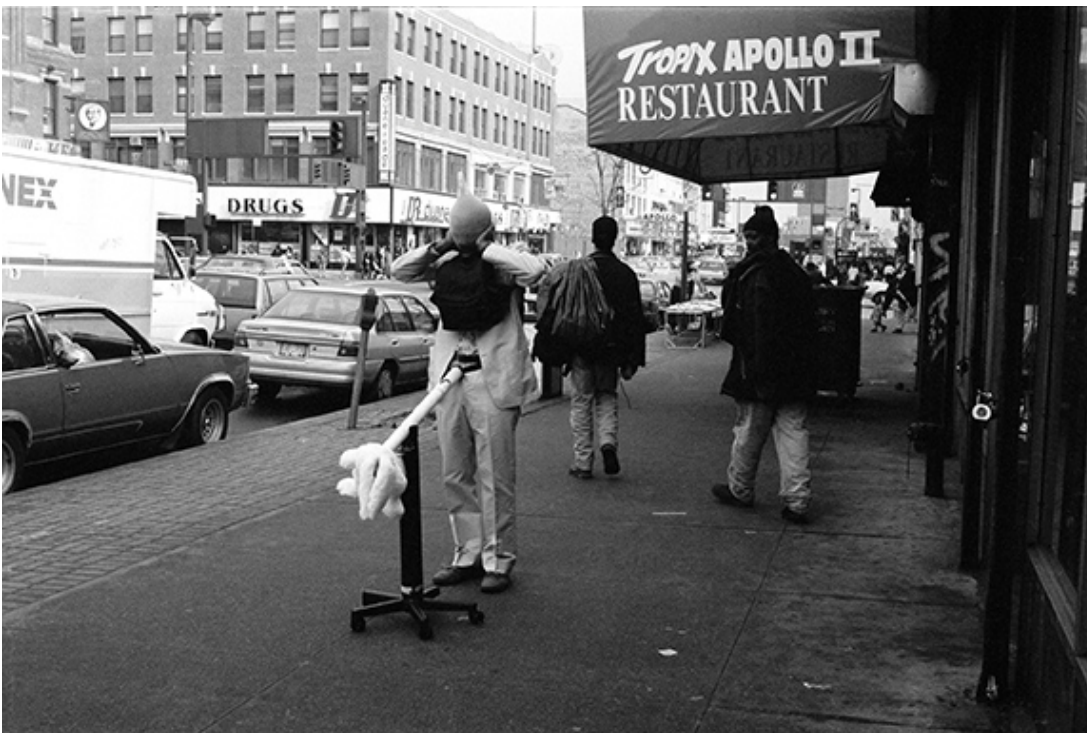
Pope.L: Member a.k.a. Schlong Journey, 125th Street, New York, 1996, inkjet print, 10 by 15 inches.

Likewise, there is joy and recognition and also something I might call refusal in Cauleen Smith's In the Wake: A Procession , a counter-performance in which Smith's flags—her contribution to the 2017 Whitney Biennial, which were hung in the lobby and the main gallery of the museum—were taken down and, in a refusal of art's commodification, carried in procession through the streets around the museum, where they might get dirty or damaged.