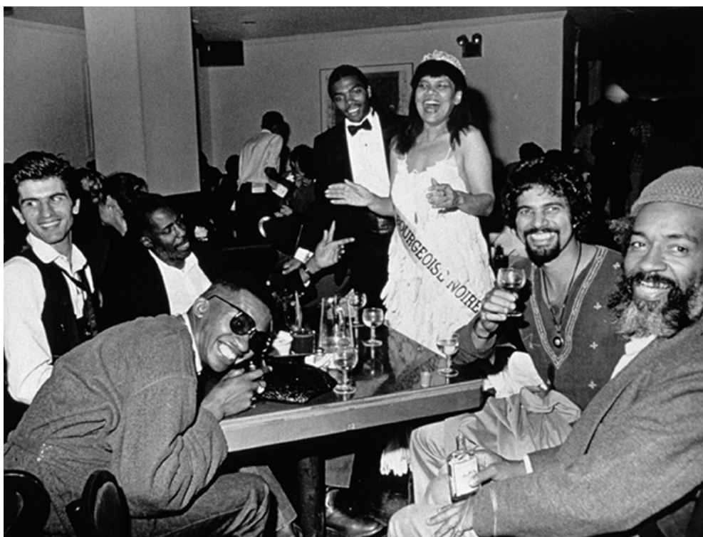
Lorraine O’Grady: Mlle Bourgeoise Noire celebrates with her friends, 1980-83/2009, silver gelatin fiber print, 7 by 9 1/4 inches.

My first encounter with what O’Grady’s words could do came when I read “Olympia’s Maid: Reclaiming Black Female Subjectivity” (1992/1994) in a collection on feminist art criticism while I was writing my dissertation. The essay was originally written for a panel on the nude in feminist art at the annual College Art Association meeting in 1992—and that context is important. O’Grady’s presence on the panel (before an academic audience that would have comprised largely white art historians) and her attention to the still-disprized Black female figure in and beyond the frame of Manet’s famous 1863 painting, brings to mind Audre Lorde delivering “The Transformation of Silence into Language and Action” at the Modern Language Association’s annual conference in 1977. At that professional meeting of academics from a variety of fields in modern language and literature, Lorde had a pointed question for those white women in colleges and universities who declined to teach Black women’s writing because “their experience is so different from mine.” “How many years,” she asked, “have you spent teaching Plato and Shakespeare and Proust?”