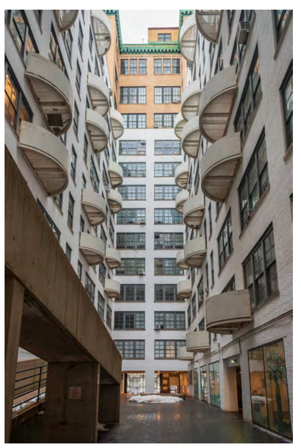
The building's courtyard.