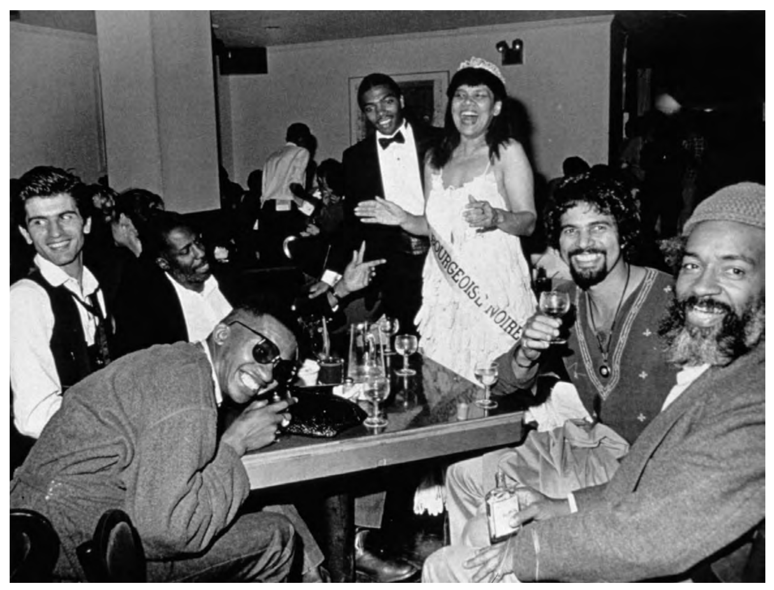
O'Grady's "Untitled (Mlle Bourgeoise Noire celebrates with her friends)" (1980–83/2009).

I only start making something once the idea is complete and I think it's good enough to put out into the world. Then it becomes about trying to live up to the idea. That is the goal of the work process. And so I'm done when I feel, "OK, I've said that." The same way you'd know when a novel is done, you know when an installation is done. You know that if you were to add one more thing to it, it would fall apart.