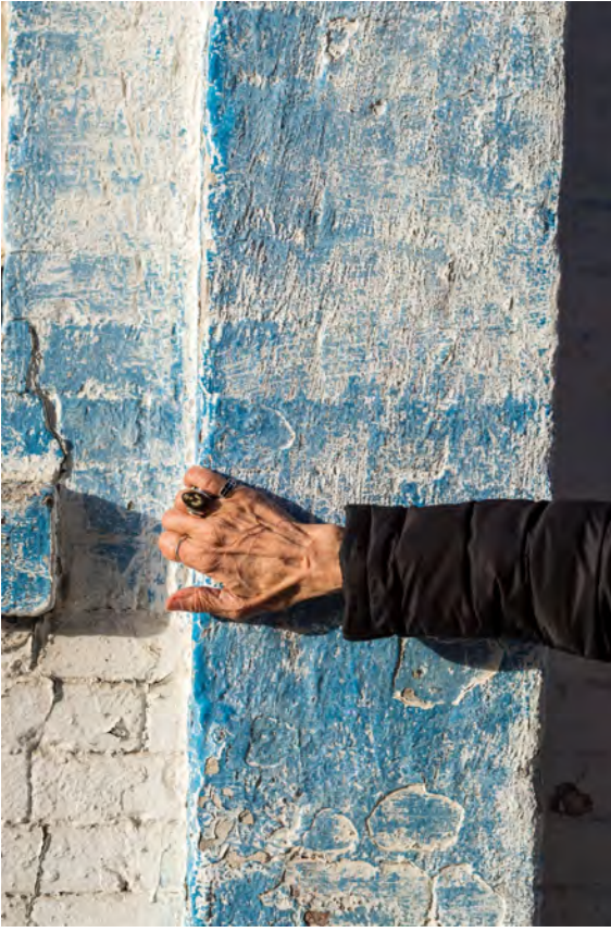
Westbeth opened in 1970, three years before O'Grady moved to New York.

Most of my friends are artists but we don't talk about art that much.